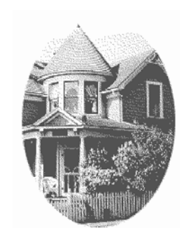
Clark County Historic Preservation Commission