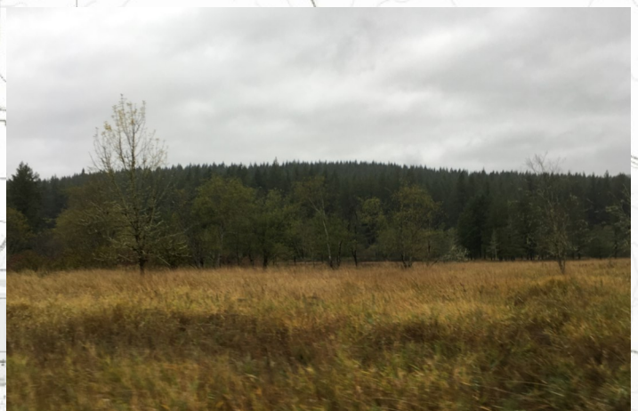
Cleanup has cost over $60 million so far and will continue into 2019.