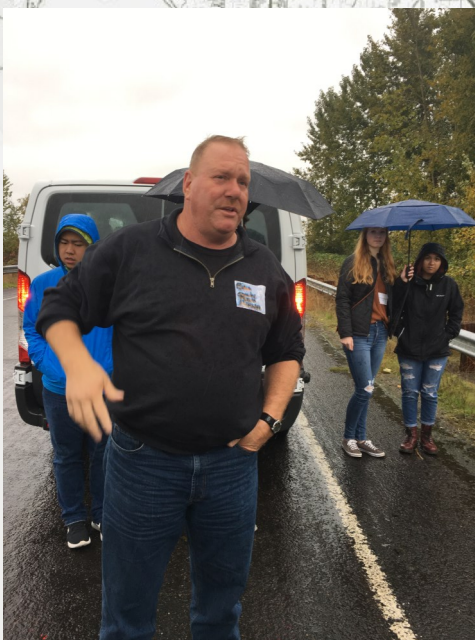
The Youth Commission subcommittee braves the rain to observe a stretch of road near Vancouver Lake that is planned to close, be rerouted and turned into a portion of the Lewis & Clark Greenway trail.

The Lewis & Clark Greenway Trail is a project currently under development. The vision is a 50 mile Century Trail traveling along the Columbia River border from Washougal to Ridgefield. The trail will connect existing trails and parks in addition to building new lengths. Once it is complete, it will serve bicyclist, pedestrians and equestrian traffic alike.