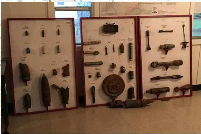
Examples of leftover explosive artillery items found onsite.

The Youth Commission seeks to provide youth voice in the planning and implementation of this cleanup project. They have been asked to generate recommendations on how the site should be used once open to the public.