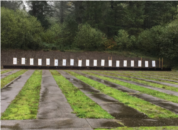
The FBI currently reserves a firing range in the camp (above) for training purposes.

Camp Bonneville has over 46 miles of roads and developed trail systems. Cougar, elk, bear and other wildlife are regularly found navigating them.