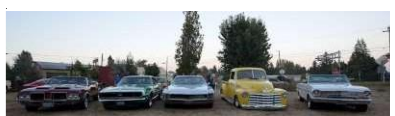
Vintage vehicles showing off their muscle at the 2018 Cruise In.