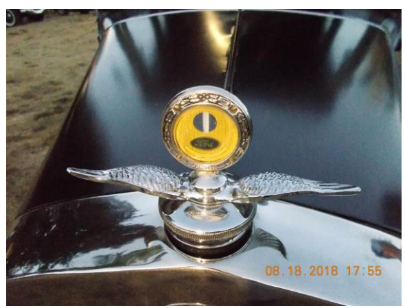
The hood ornament is from the oldest car in the show, a 1930 Ford. It is actually a thermometer from the driver's point of view to monitor engine temperature.

Although it was smaller than last year, everyone had a really good time. The Greater Brush Prairie Neighborhood Association gave out 80 free hamburgers with chips and soda to everyone that attended the Cruise In.