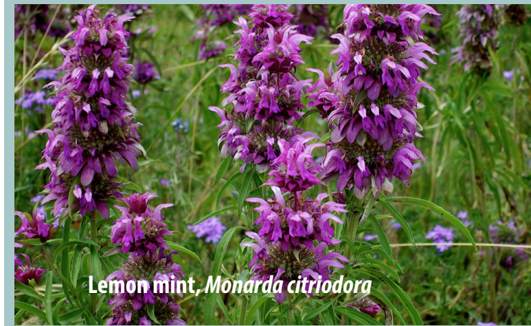
Lemon mint, Monarda citriodora