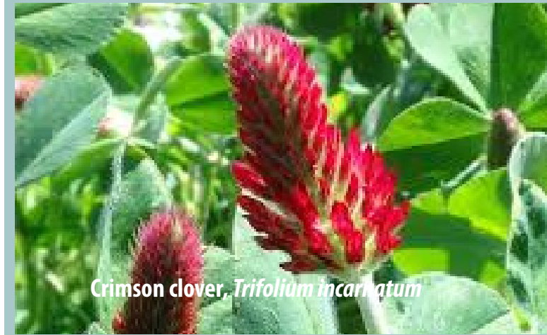
Crimson clover, Trifolium incarnatum