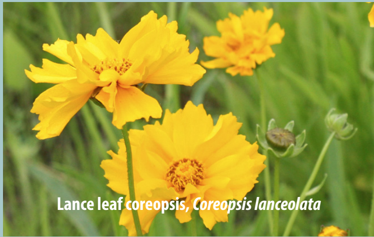
Lance leaf coreopsis, Coreopsis lanceolata