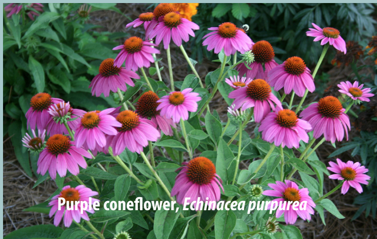
Purple coneflower, Echinacea purpurea