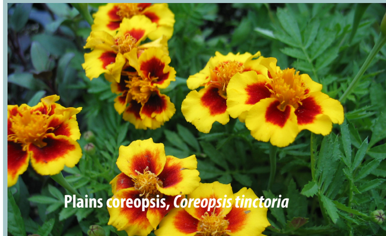
Plains coreopsis, Coreopsis tinctoria