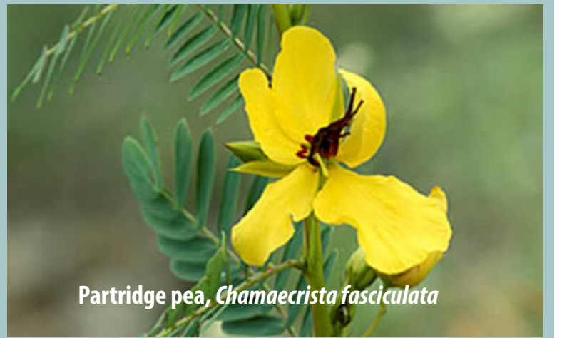
Partridge pea, Chamaecrista fasciculata