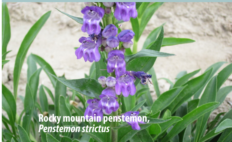
Rocky mountain penstemon, Penstemon strictus