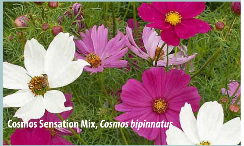
Cosmos Sensation Mix, Cosmos bipinnatus