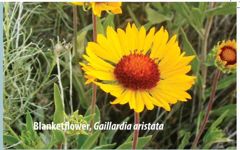
Blanketflower, Gaillardia aristata