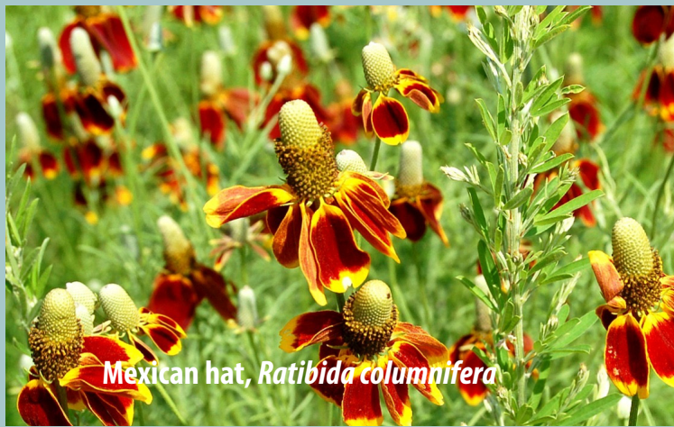
Mexican hat, Ratibida columnifera