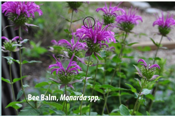
Bee Balm, Monarda spp.