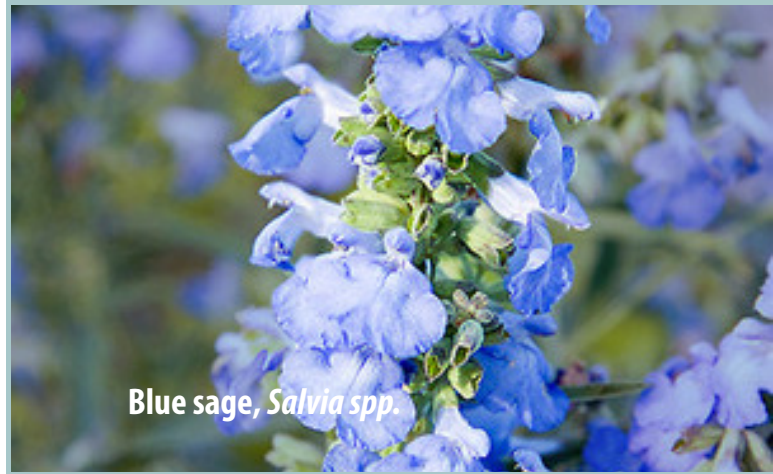
Blue sage, Salvia spp.