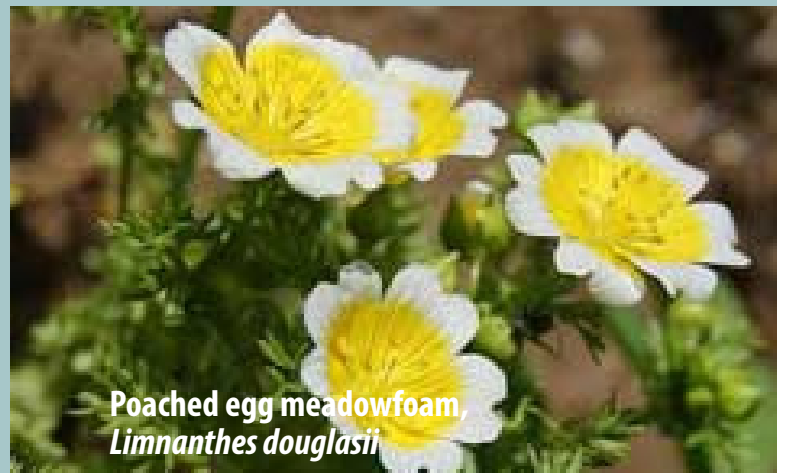
Poached egg meadowfoam, Limnanthes douglasii