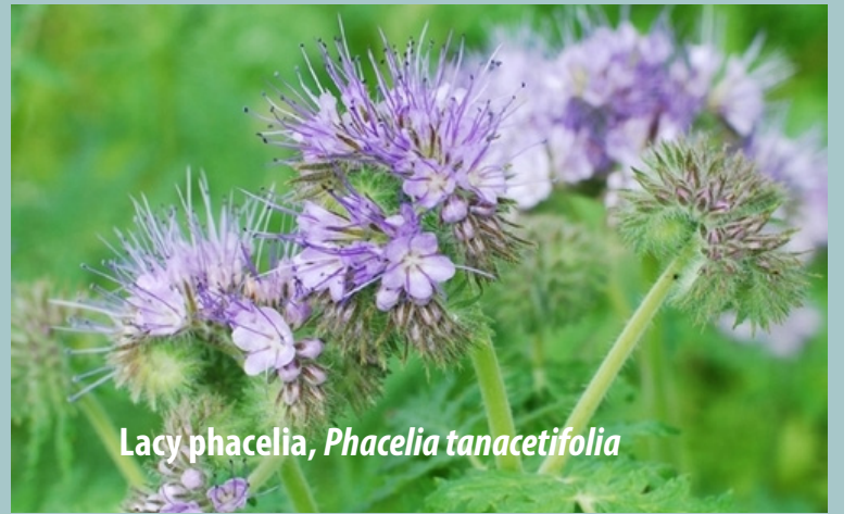
Lacy phacelia, Phacelia tanacetifolia