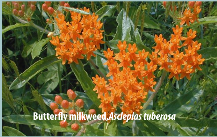
Butterfly milkweed, Asclepias tuberosa