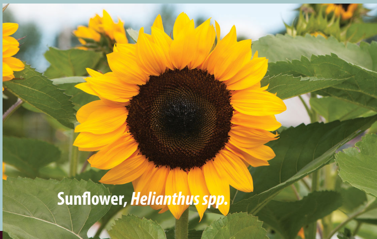
Sunflower, Helianthus spp.

These plants are part of the Bee-U-tify pollinator project.