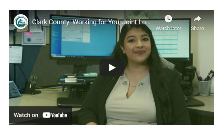
Join our team! Joint Lobby Specialist I-III

I invite you to watch CVTV interviews aired in Q3.