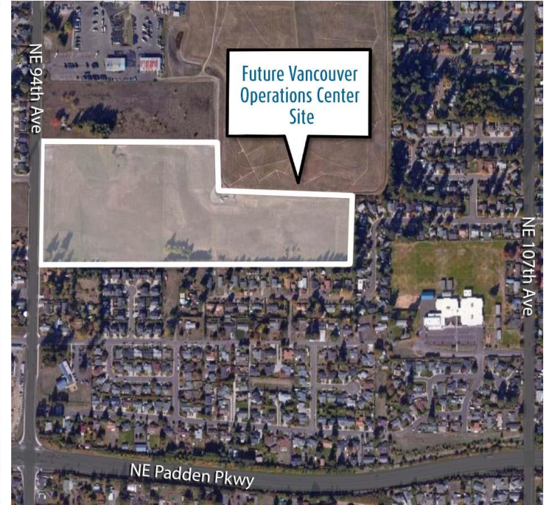
Public Works New Operations Campus - 8