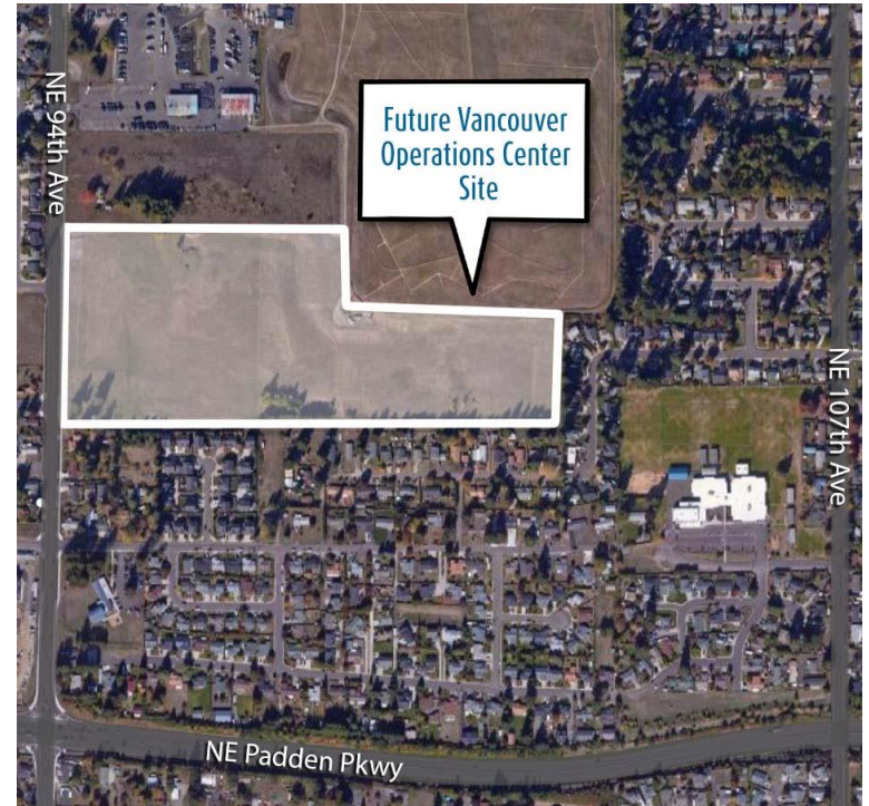
Public Works New Operations Campus - 7