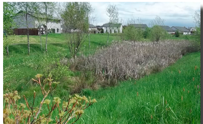
Stormwater facility at Parkside Manor north of Whipple Creek

Adjacent residents could experience a modest amount of dust, noise and vibration from construction. The contractor, Nutter Corp., will be required to have a community liaison to handle any problems that might arise.