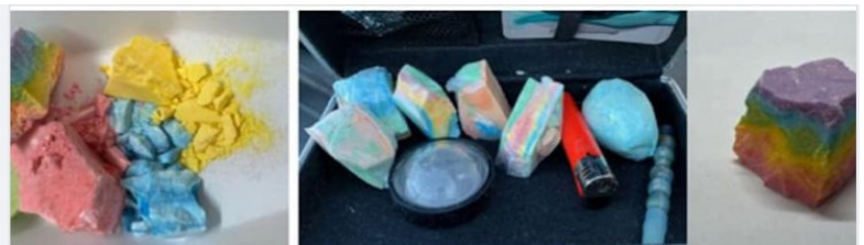
3 and 4: Seizure in Medford, OR

https://www.koin.com/.../fentanyl-like-a-bomb-going-off.../