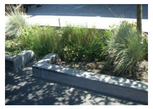
Parking Area/Bio Swales