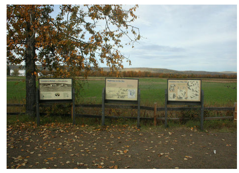
Interpretive & Directional Signage