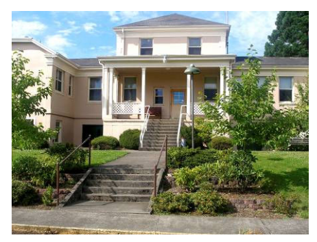
Historic Administration Building