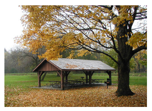
Open Air Shelter