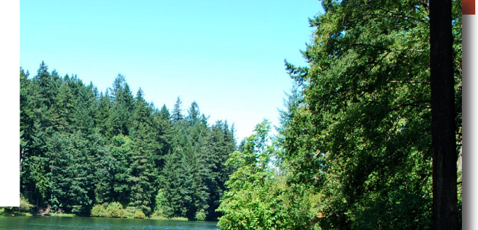
East shore of Fallen Lake with picnic tables