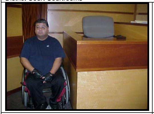
District Court Courtrooms

Note: Meeting on April 17, 2007 with General Services director, Facilities Management manager and Court Administrators. Jury boxes do not need to be accessible from Courtroom. Jurors are seated through the back door and path is accessible.