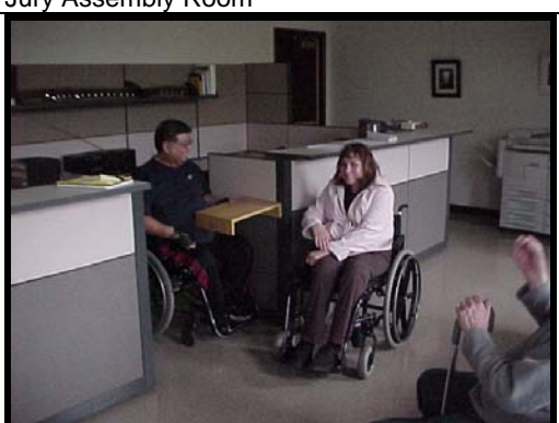
Jury Assembly Room

The reception counter in the jury assembly room exceeds height requirements for accessibility. A portion of the counter top should be lowered as detailed in the ANSI requirement below. However, as an alternate solution, a folding desk top may be considered to be attached to the side of the counter as demonstrated in the photo to the left.