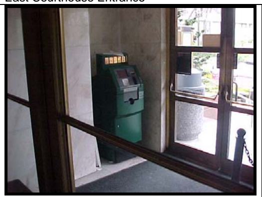
East Courthouse Entrance

ANSI 308.3.1 Unobstructed – Where a clear floor space allows a parallel approach to an element and the side reach is unobstructed, the high side reach shall be 48 inches maximum and low side reach shall be i5 inches minimum above the floor.