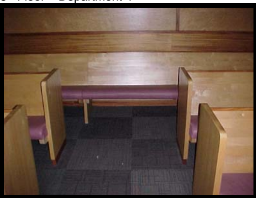
5<sup>th</sup> Floor – Department 4

There is no wheelchair seating in the spectator area. Recommend removing 48" of the bench against the back wall for wheelchair parking. If located in this area, individuals in wheelchairs should have a fairly unobstructed view of the proceedings and will not obstruct the view of spectators in the benches.