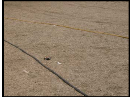
Electrical cords in pedestrian pathways.