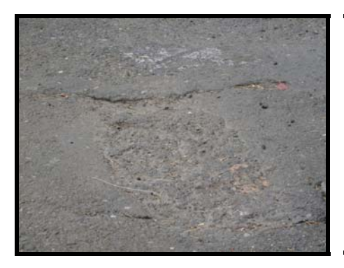
Pavement indention on SW corner of Clark County Dairy Women's Association booth. Indention is about 1.75 inches deep.