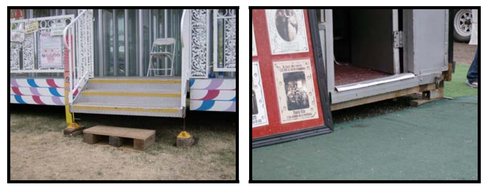
With no ramp, this ride is inaccessible to persons in mobility devices