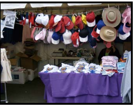
Merchandise that is elevated on racks or shelves cannot be accessed by some persons with disabilities