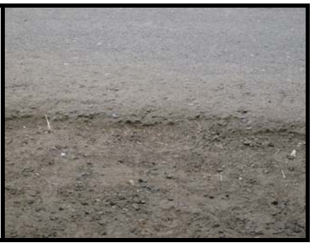
The pavement edge to the vendor displays on the south side of the horse riding arena are too high. Wheelchairs could easily fall over. Also, elevated edges are a potential trip and fall hazard.