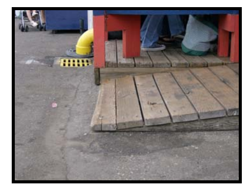
Food concession ramp – South side of South Hall 1 – is too steep. The edge of the ramp on the floor is too high – Approx 1" lip.