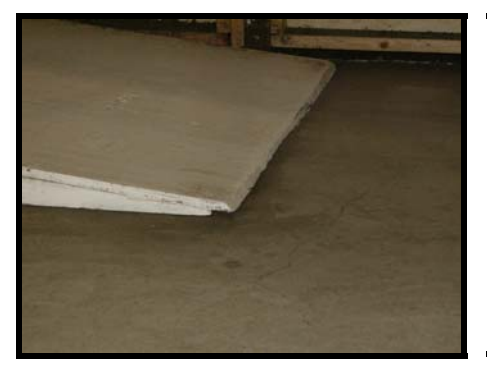
Ramp on west end of horse riding arena to elevated spectator platform appears to be too steep. The edge of the ramp on the floor is too high – Approx 1" lip.