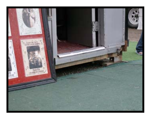
Many vendor displays are inaccessible to persons with wheelchairs or mobility devices such as walkers.

The pavement edge to the vendor displays on the south side of the horse riding arena are too high. Wheelchairs could easily fall over. Also, elevated edges are a potential trip and fall hazard.