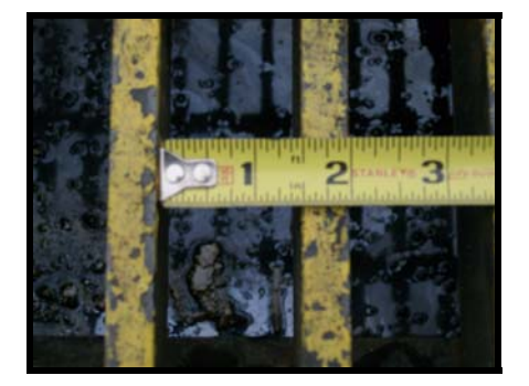
Grate in Midway with 1.5" opening