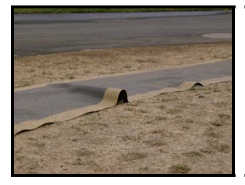
Mats in amusement park area pose a trip and fall hazard and are very difficult to negotiate in a mobility device