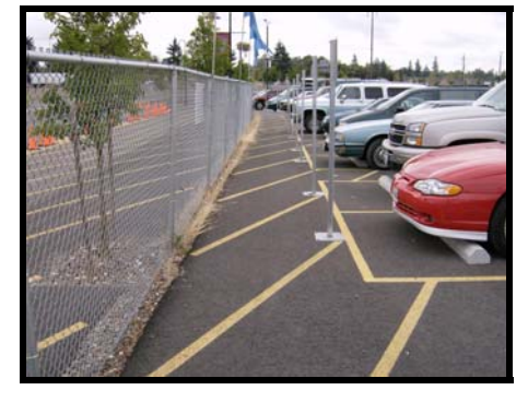
Access aisle in NW parking lot should be kept clear of debris