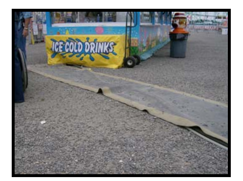
Mats in amusement park area pose a trip and fall hazard and are very difficult to negotiate in a mobility device

This mat provides better protection to the cords and pedestrians. However, the slope of the pad is a little too steep and is difficult to cross in a wheelchair