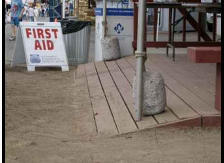
First Aid station ramp is too steep.