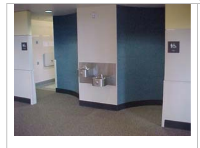
Typical installation of all drinking fountains on 3<sup>rd</sup> floor and throughout the building.

Item: Drinking Fountain - 3rd Floor Lobby