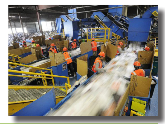
Introduction - Chapter 1