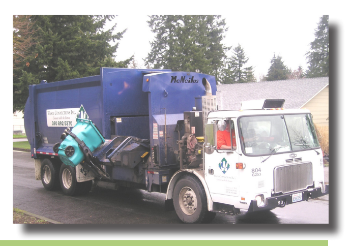
Clark County Solid Waste Management Plan 2015

The Disposal Agreement between Clark County, the City of Vancouver and the Leichner Brothers Land Reclamation Corporation establishes responsibilities for closure, post-closure maintenance and groundwater remediation of the closed Leichner Landfill.