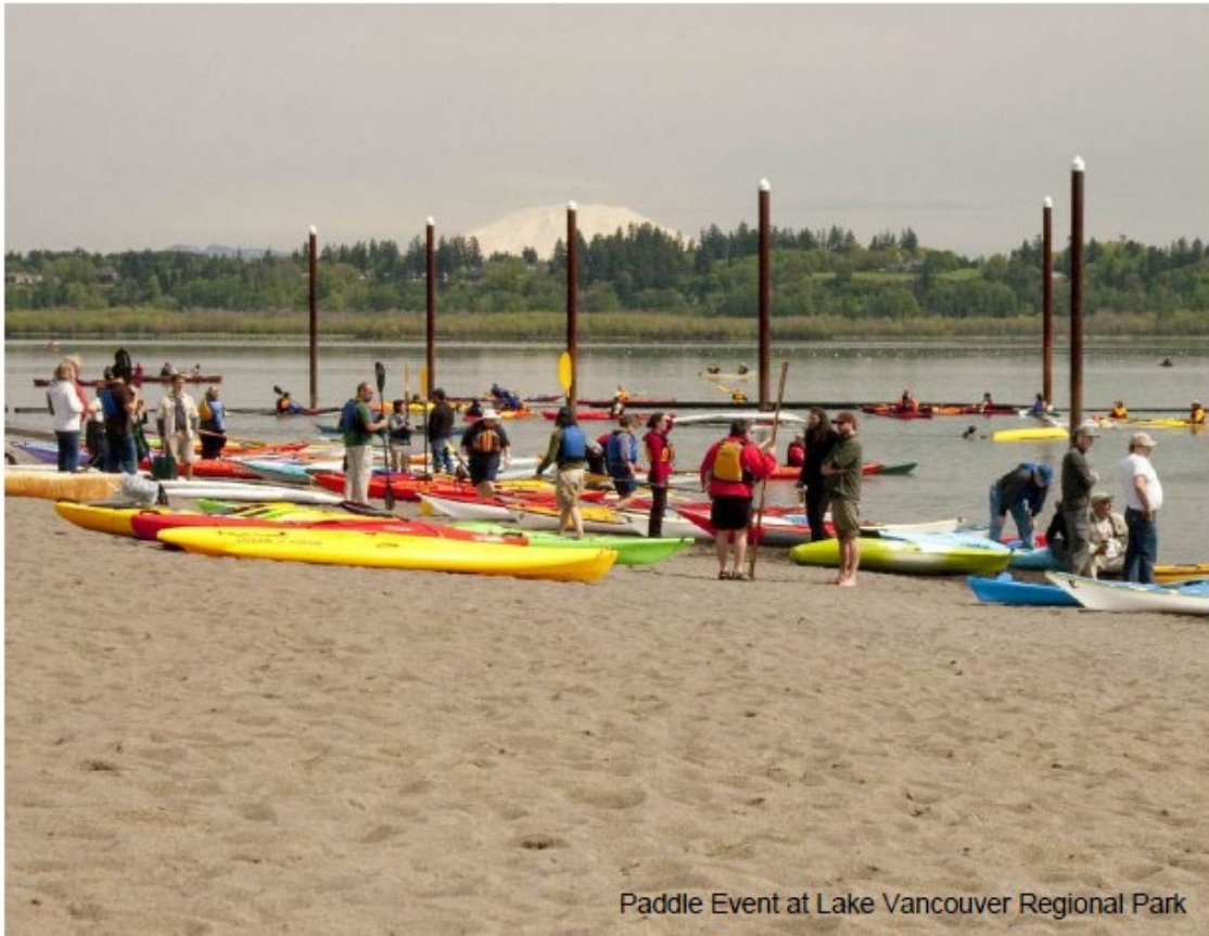
Paddle Event at Lake Vancouver Regional Park

Virtual Meeting via Microsoft Teams and In-Person at Luke Jensen Sports Park