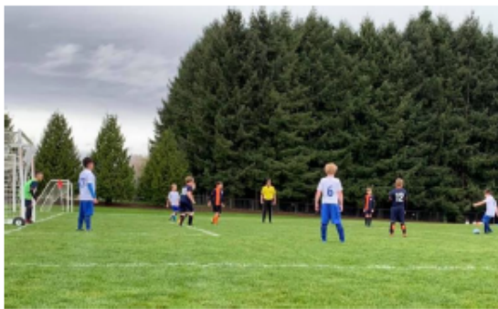
Figure 6 - Soccer Game at Felida Community Park