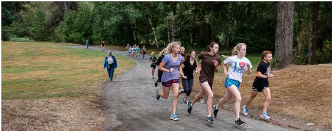
Figure 2 - 5k Run at Lewisville Regional Park