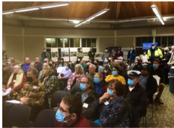
Figure 3 - Public Meeting at Bud Van Cleve Meeting Room

The GCPD levy fund is restricted to a maximum rate of $0.27 per $1,000 of assessed value and is currently $0.14 per $1,000 of assessed value. The budget for the GCPD cannot exceed an increase of 1% per year or exceed $0.27 per $1,000 of assessed value, whichever is less. Currently, the expenditures for operating the GCPD exceeds revenues, and the reserve for the fund is being monitored.