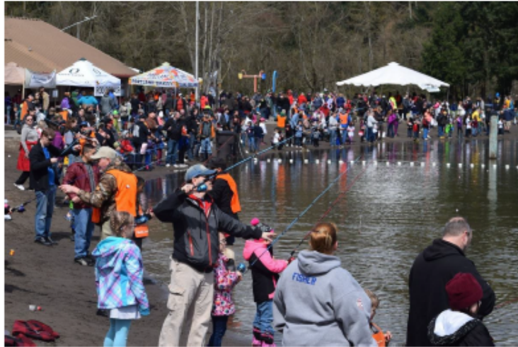
Figure 5 - Kline Kids Fishing Derby

Appendix A table 4 shows the current use rates by park for shelters. There tends to be parks that are used more than others and the capacity of the shelter.