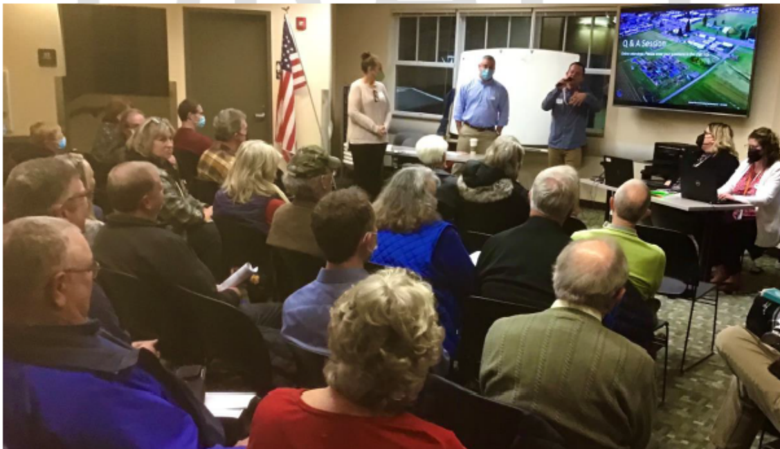
Figure 7 - Public Meeting at Bud Van Cleve Meeting Room

Clark County will hold a hearing on X,XX,XXXX to review recommendations.