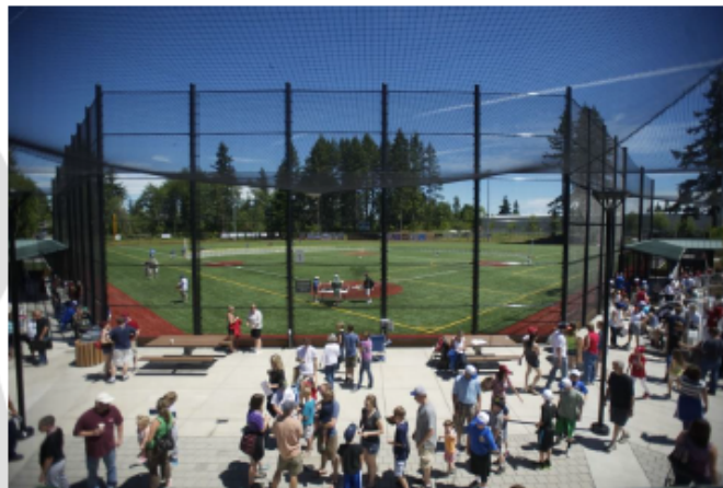
Figure 4 - Baseball Game at Luke Jensen Community Sports Park

There is currently a parking fee at four regional parks: Lewisville, Frenchman's Bar, Vancouver Lake, and the Kline line portion of Salmon Creek. A parking fee was established to assist with offsetting use of the general fund to manage these parks. The current program provides four rate levels for vehicles, based on space utilization (size). These fees range from $2 to $8 per day. A 12-month pass is available for $30. The pass is assigned to a specific vehicle. Daily fees are collected via electronic parking meters or at fee booths staffed seasonally. Parking fees can be paid via cash, debit, or credit cards. A 12-month parking pass can be purchased online, at a fee booth or at the parks division office. The division averages $530,000 in gross income and $339,000 in net income from the parking fee program.