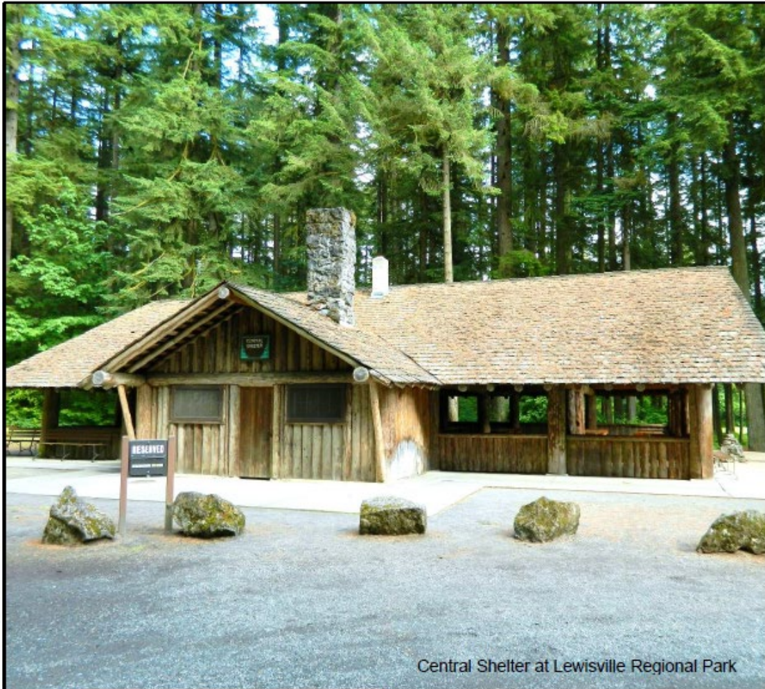
Central Shelter at Lewisville Regional Park