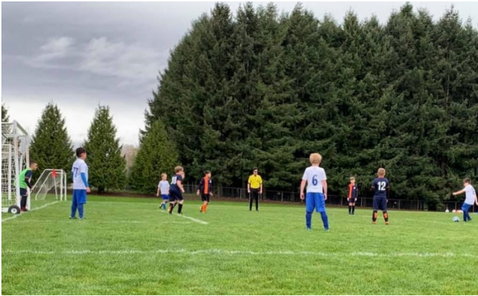
Figure 6 - Soccer Game at Felida Community Park

providers. Many providers require a fee to open restrooms, a fee for a site administrator, and other fees in addition to an hourly rental fee.