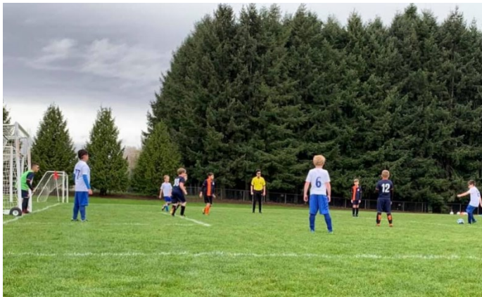
Figure 6 - Soccer Game at Felida Community Park

providers. Many providers require a fee to open restrooms, a fee for a site administrator, and other fees in addition to an hourly rental fee.