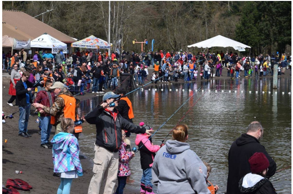
Figure 5 - Kline Kids Fishing Derby

Appendix A table 4 shows the current use rates by park for shelters. There tends to be parks that are used more than others and the capacity of the shelter.