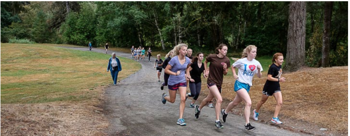
Figure 2 - 5k Run at Lewisville Regional Park