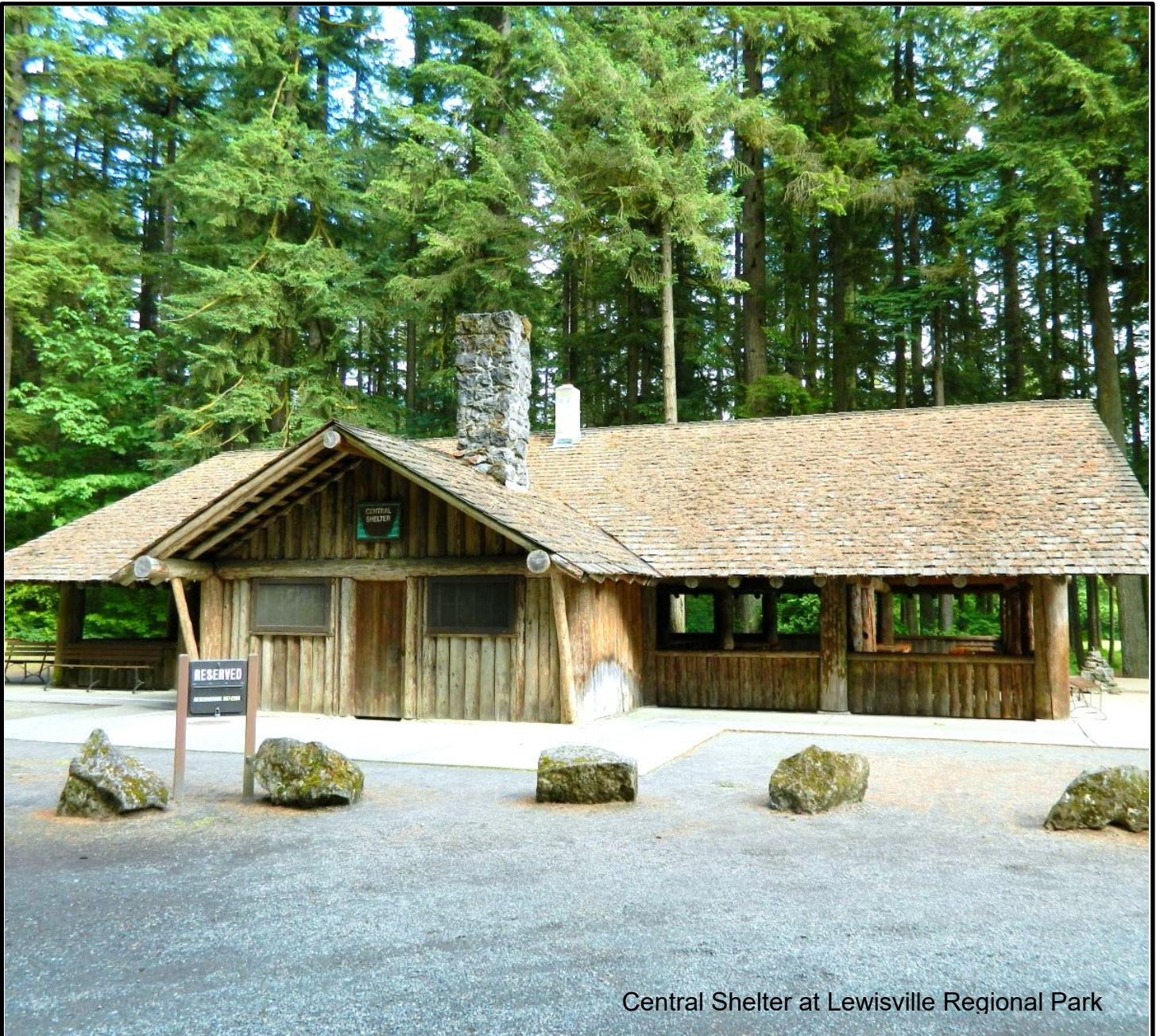
Central Shelter at Lewisville Regional Park