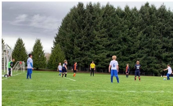
Figure 6 - Soccer Game at Felida Community Park

providers. Many providers require a fee to open restrooms, a fee for a site administrator, and other fees in addition to an hourly rental fee.