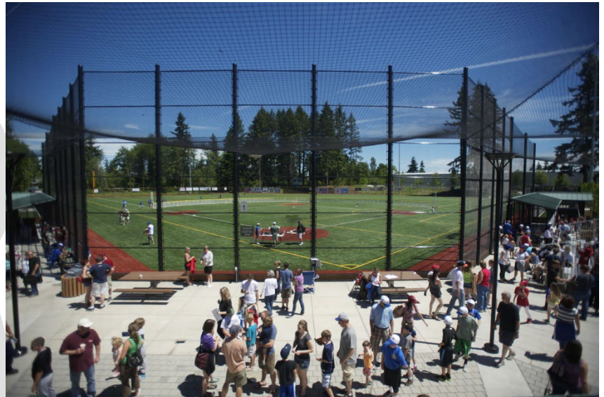
Figure 4 - Baseball Game at Luke Jenson Community Sports Park

There is currently a parking fee at four regional parks: Lewisville, Frenchman's Bar, Vancouver Lake, and the Klineline portion of Salmon Creek. A parking fee was established to assist with offsetting use of the general fund to manage these parks. The current program provides four rate levels for vehicles, based on space utilization (size). These fees range from $2 to $8 per day. A 12-month pass is available for $30. The pass is assigned to a specific vehicle. Daily fees are collected via electronic parking meters or at fee booths staffed seasonally. Parking fees can be paid via cash, debit, or credit cards. A 12-month parking pass can be purchased online, at a fee booth or at the parks division office. The division averages $530,000 in gross income and $339,000 in net income from the parking fee program.