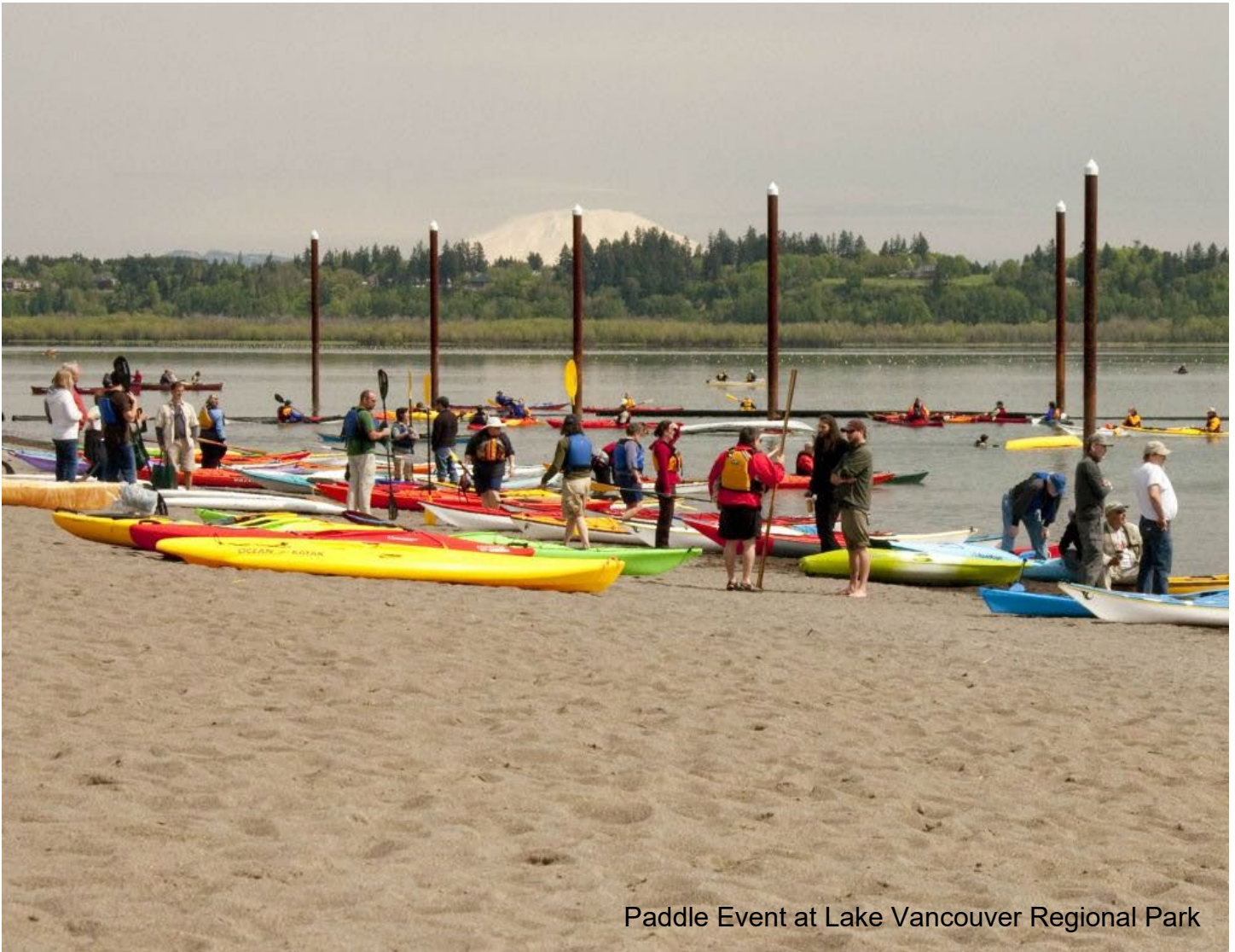
Paddle Event at Lake Vancouver Regional Park