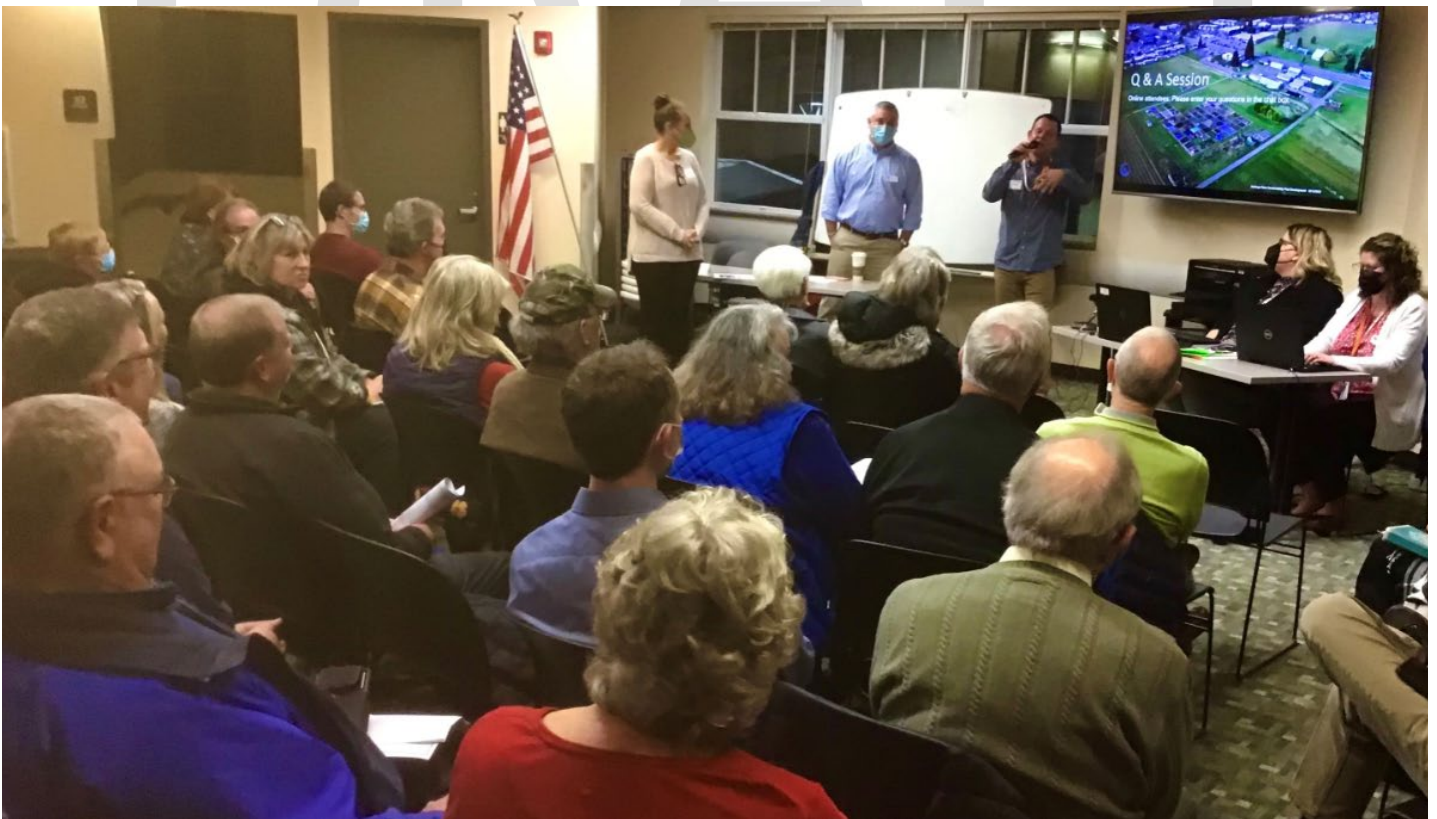
Figure 7 - Public Meeting at Bud Van Cleve Meeting Room

Clark County will hold a hearing on X,XX,XXXX to review recommendations.