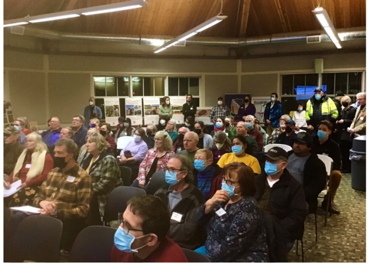
Figure 3 - Public Meeting at Bud Van Cleve Meeting Room

The GCPD levy fund is restricted to a maximum rate of $0.27 per $1,000 of assessed value and is currently $0.14 per $1,000 of assessed value. The budget for the GCPD cannot exceed an increase of 1% per year or exceed $0.27 per $1,000 of assessed value, whichever is less. Currently, the expenditures for operating the GCPD exceeds revenues, and the reserve for the fund is being monitored.