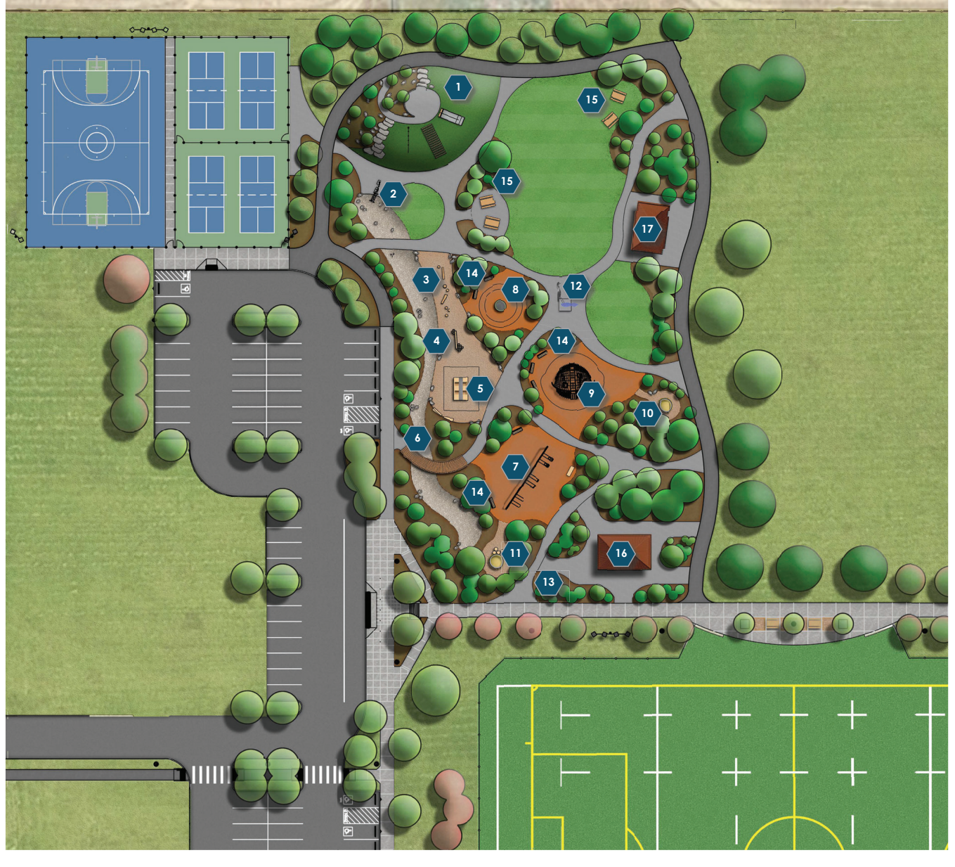
Play slope Water & sand play Balance logs 3 Stepping columns Bird house climber Dry creek & footbridge 6 Accessible swings Universal carousel 8 Accessible climbing structure 9 Bird nest imaginative play 10 Elevated bird nest 11 Large bird sculpture 12 Bird track scavenger hunt 13 Benches 14 Picnic tables Restroom and drinking fountain Picnic shelter