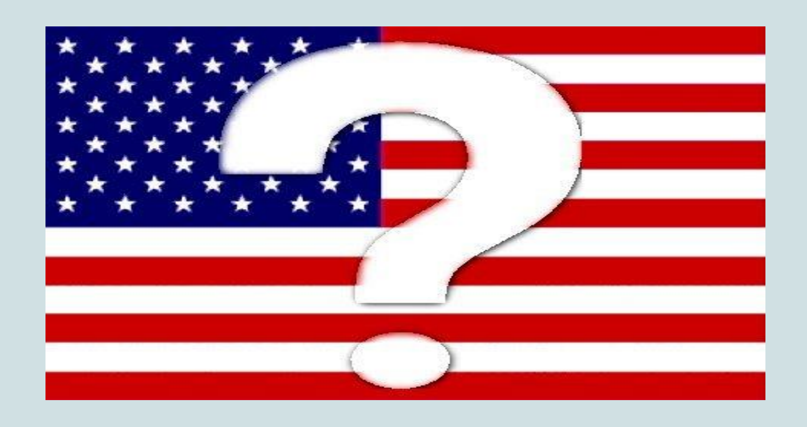
THANK YOU FOR YOUR TIME AND ATTENTION