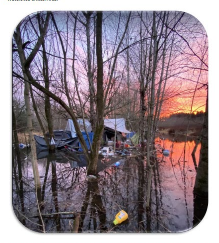
This document is designed to be viewed Electronically - Titles and Pictures contain Hyperlinks

We have a need for a land restoration and water pollution mitigation Plan for the Burnt Bridge Creek Watershed Critical Area.