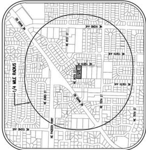
VICINITY MAP N.T.S.