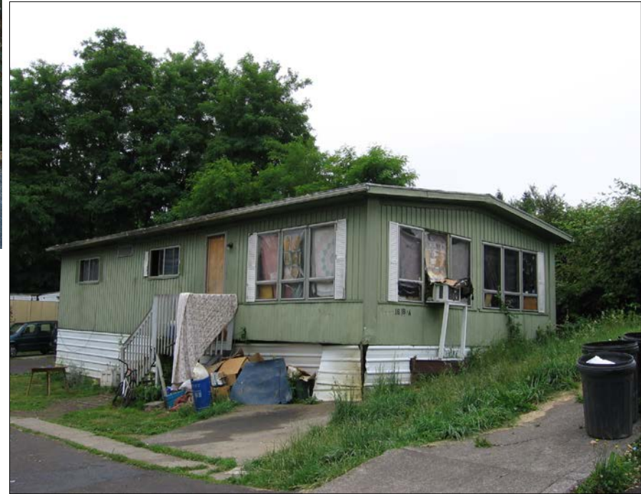
Mobile 1976 and older