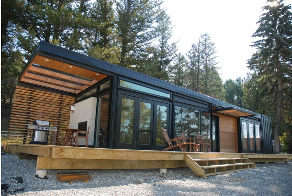
Modular 2018 Urban Design