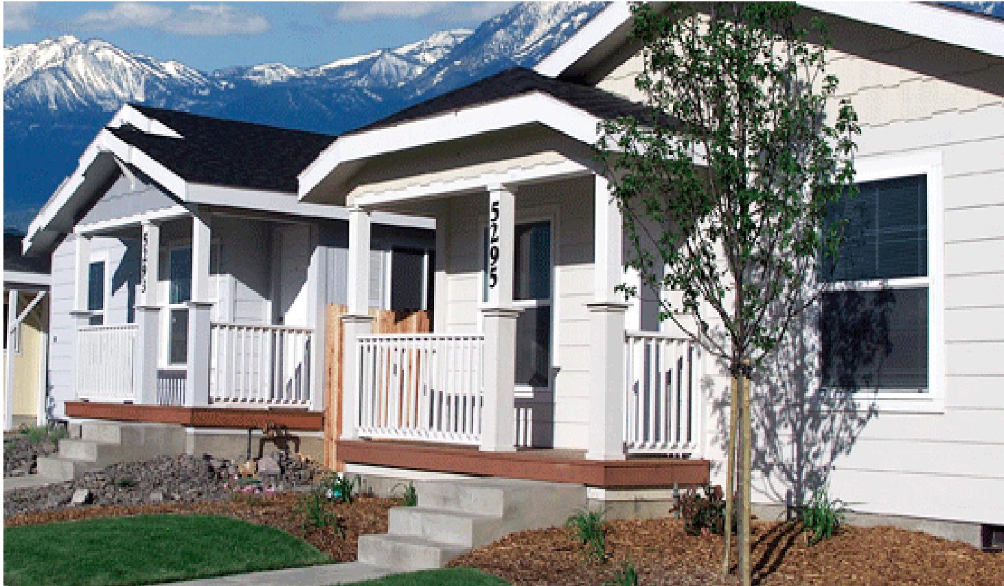
Craftsman Homes – Reno, Nevada