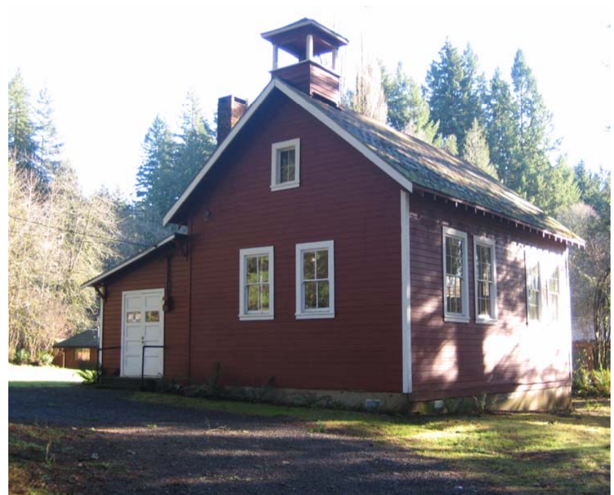
Venersborg School , NRHP, WHR