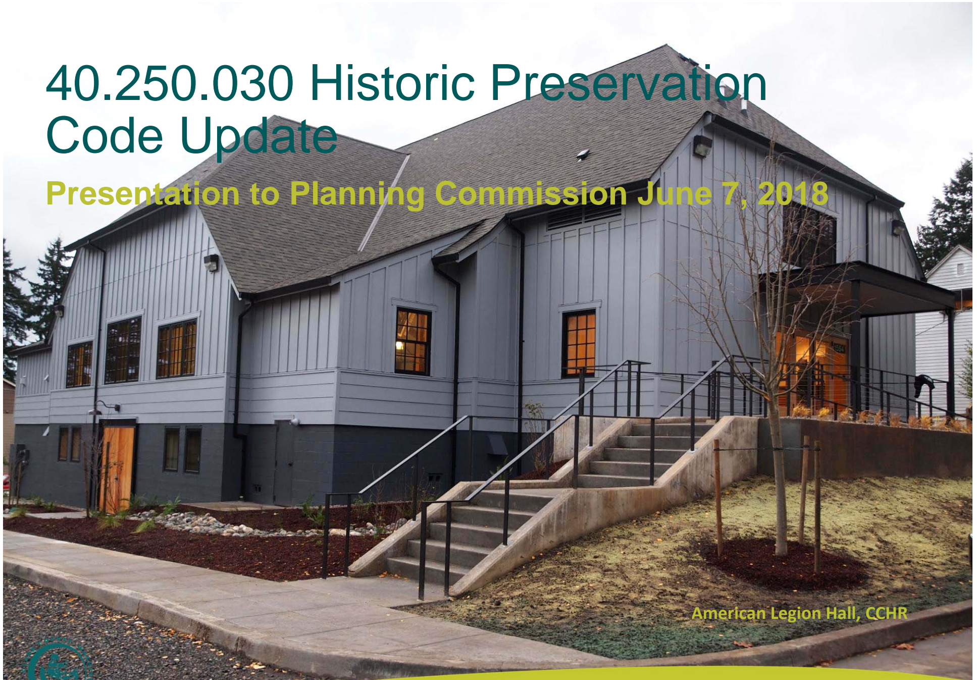
American Legion Hall, CCHR

Presentation to Planning Commission June 7, 2018