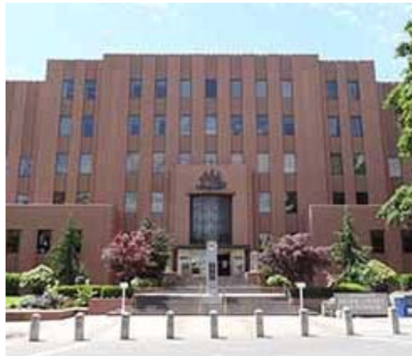
Clark County Courthouse , NRHP, WHR