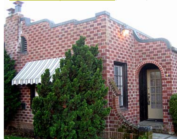
Wisteria Court Apartments , CCHR