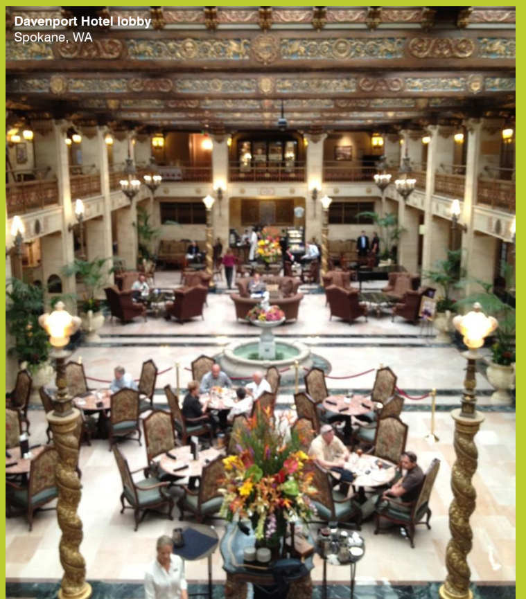
Davenport Hotel lobby Spokane, WA

The Special Valuation program is reviewed locally by Historic Preservation Commissions in Certified Local Government (CLG) communities.