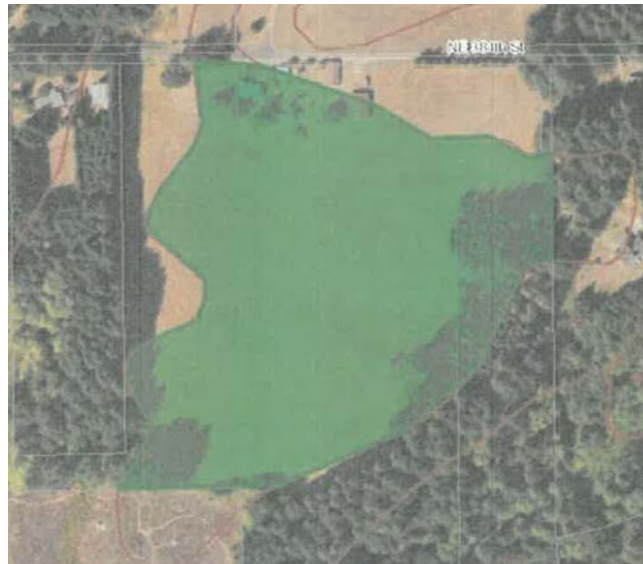
12.66 Acres HcB