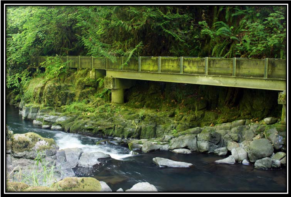
Cedar Creek – Clark County, WA