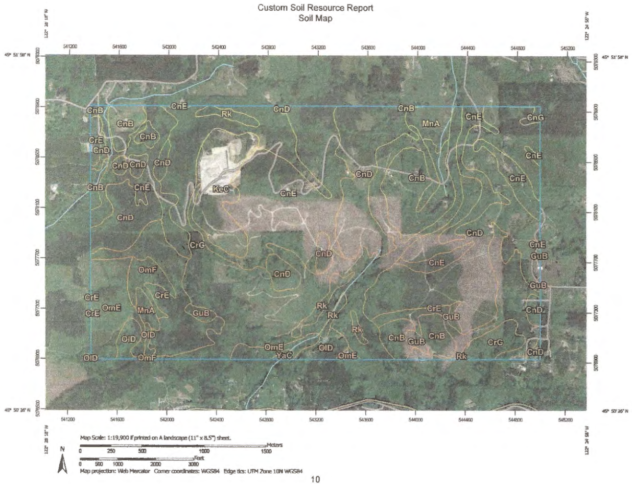
Figure-3 NRCS Soils Map of Yaclt Mountain & East Fork Region

We hope this information will be helpful to achieving “balance growth & progress” while protecting our water resources that are so critical to the future of the citizens of Clark County.