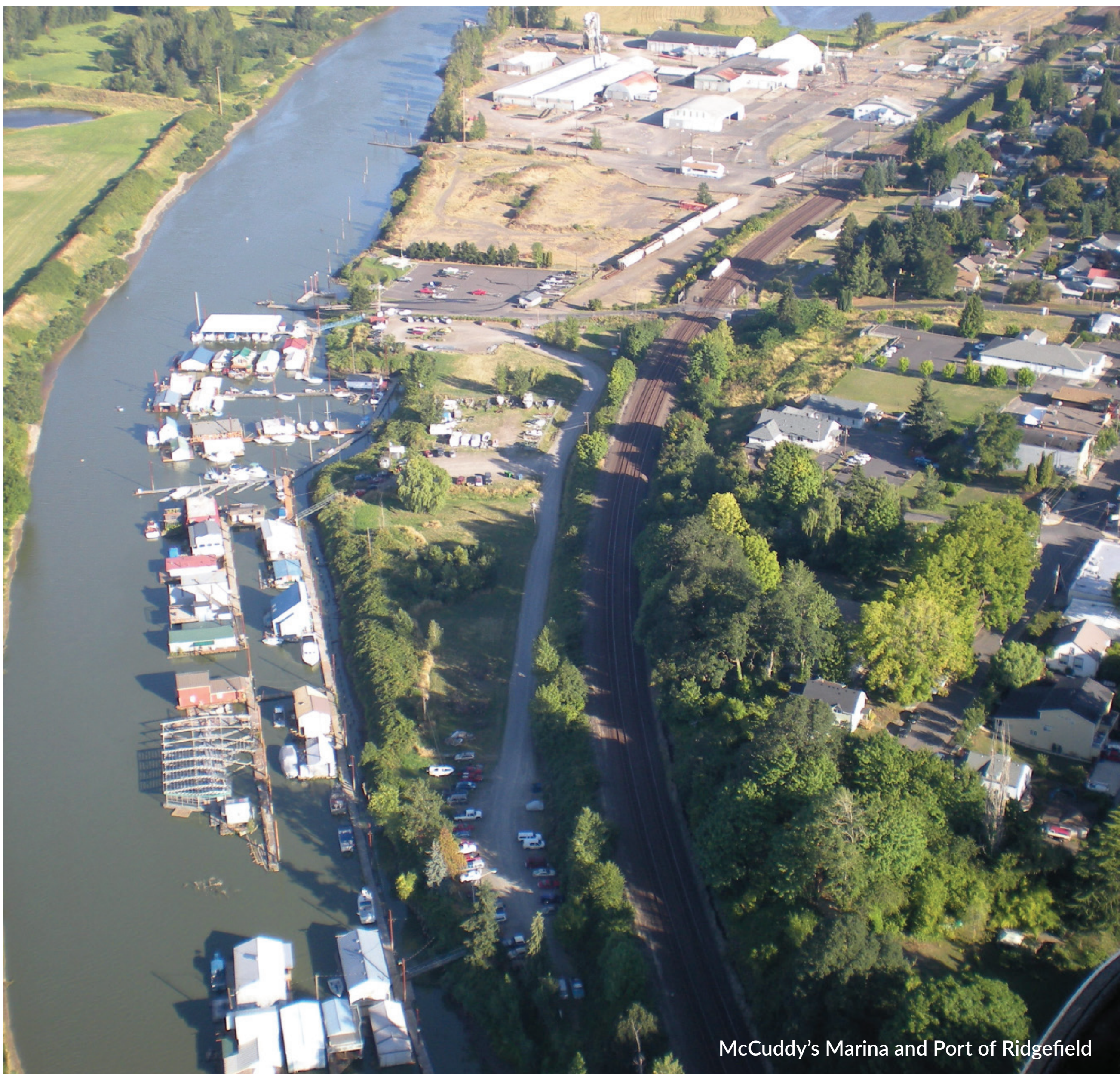
McCuddy's Marina and Port of Ridgefield