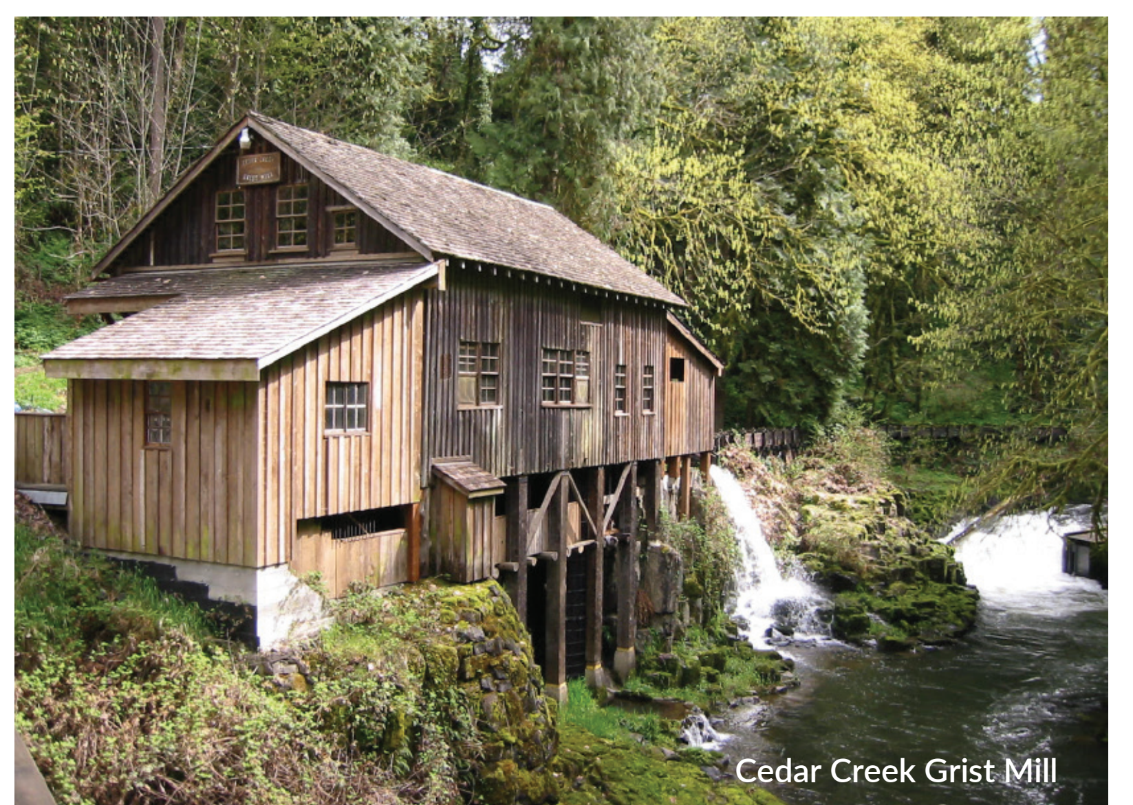
Cedar Creek Grist Mill