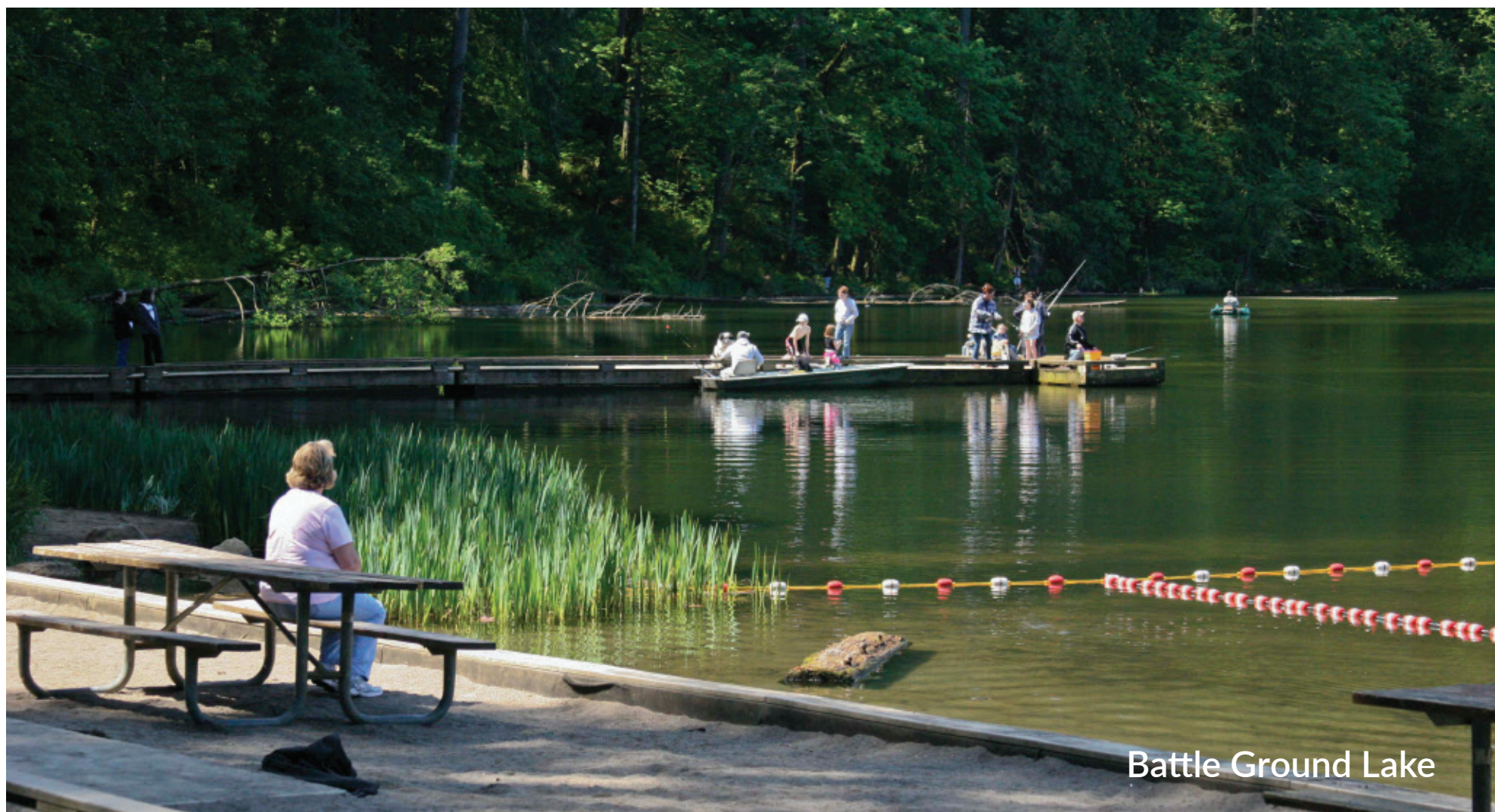
Battle Ground Lake