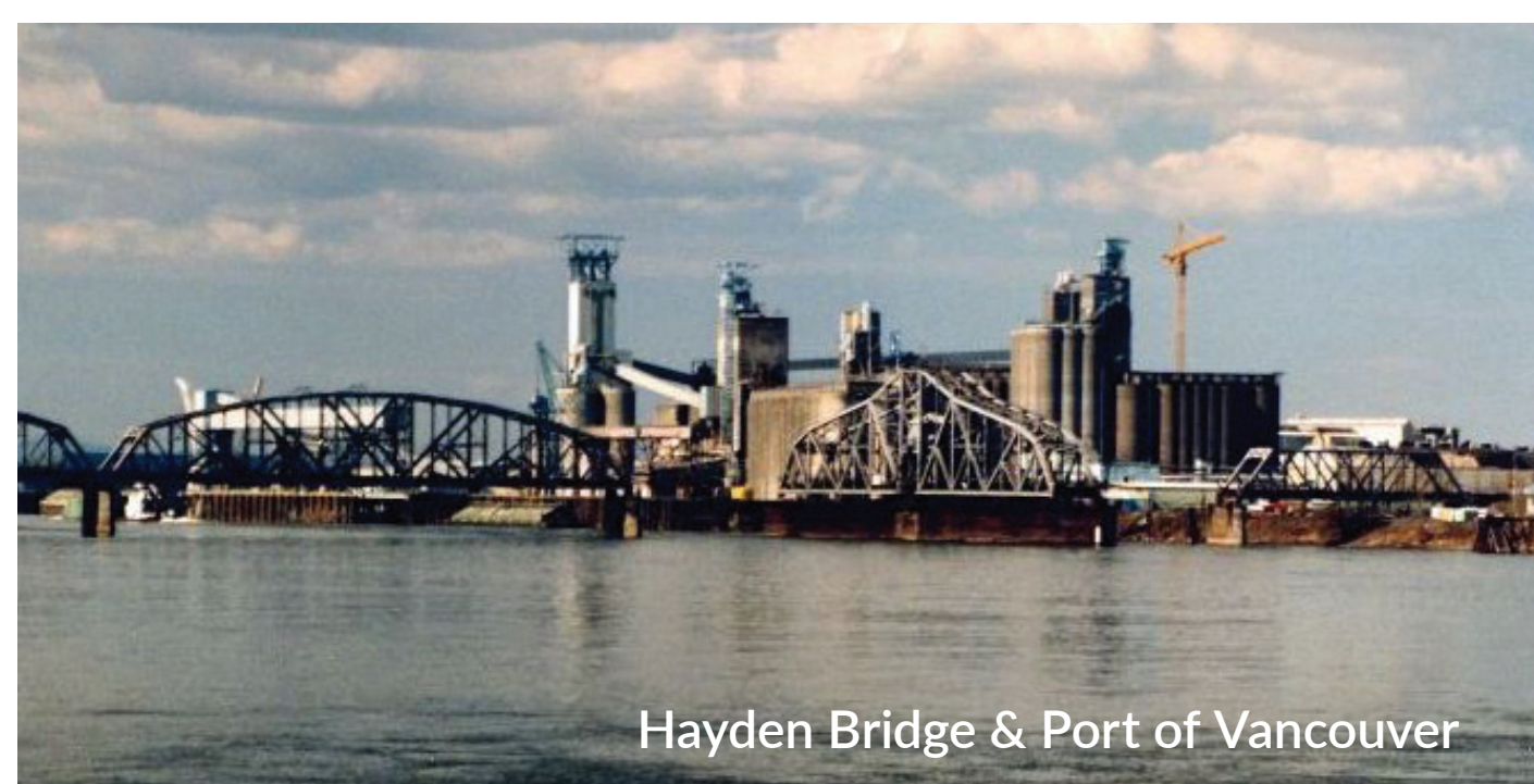
Hayden Bridge & Port of Vancouver