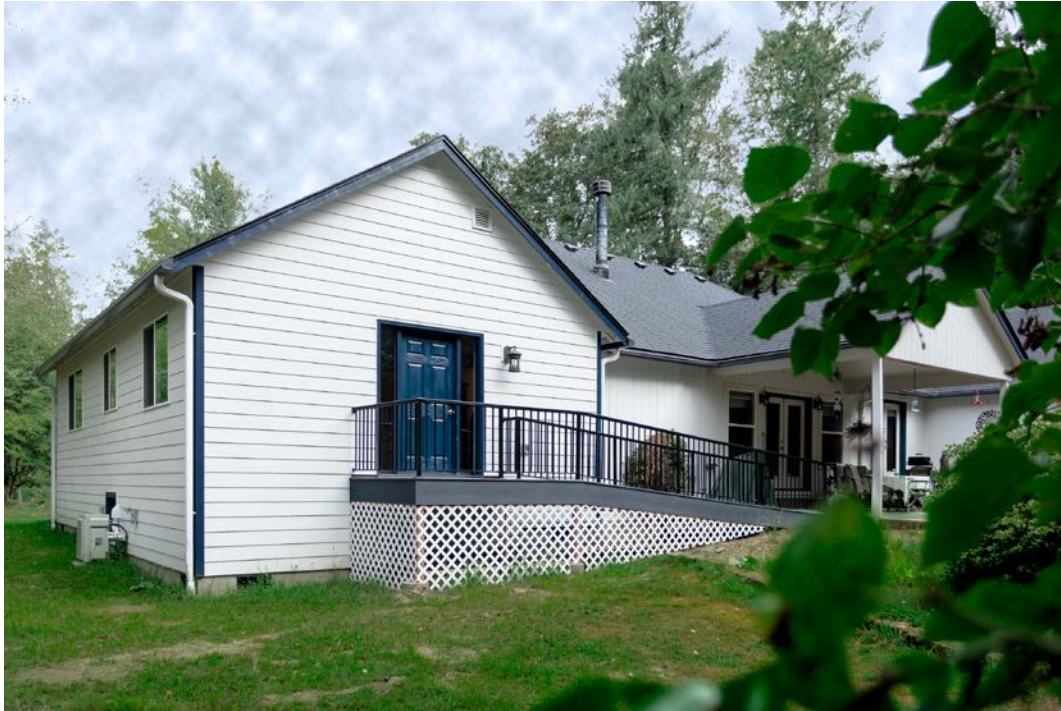
House on Remodeled Homes Tour