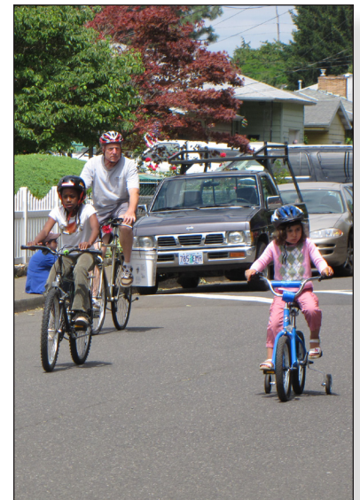
Walking and bicycling are safe and healthy modes of transportation and recreation, which contribute to quality of life