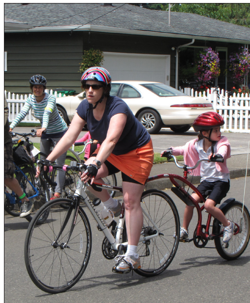
Safe Routes to School and other educational programs improve safety and encourage students to walk and bicycle