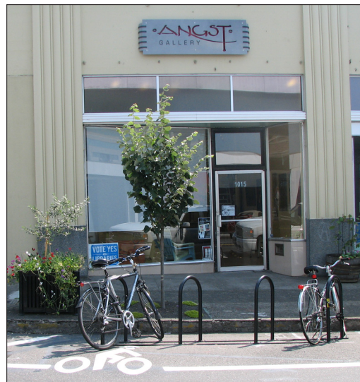
Bicycle parking can determine whether someone can choose to bicycle to work, the store, or to meet friends for coffee.