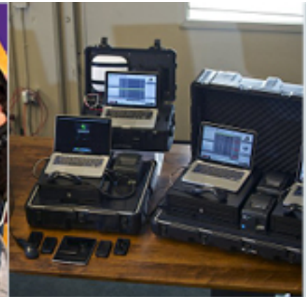
START UP ShopBox