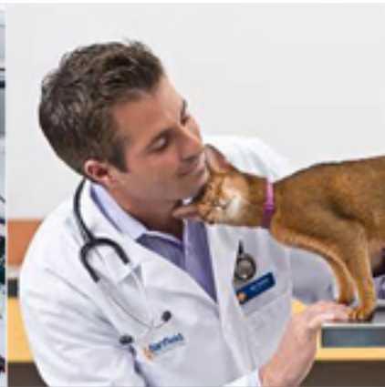
RELOCATE Banfield Pet Hospital