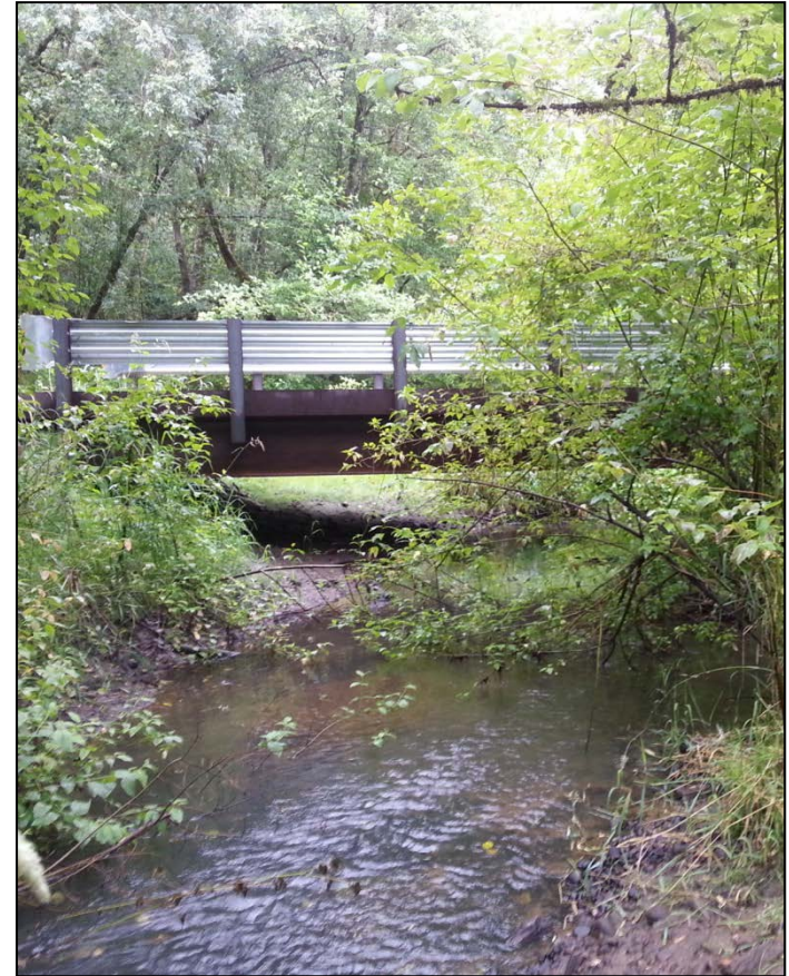
Former culvert was a fish passage barrier, now fish-friendly bridge installed by Clark CD.