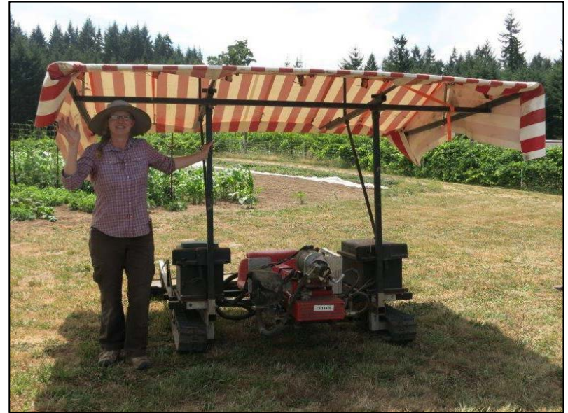
Local farmer with converted electric tractor.