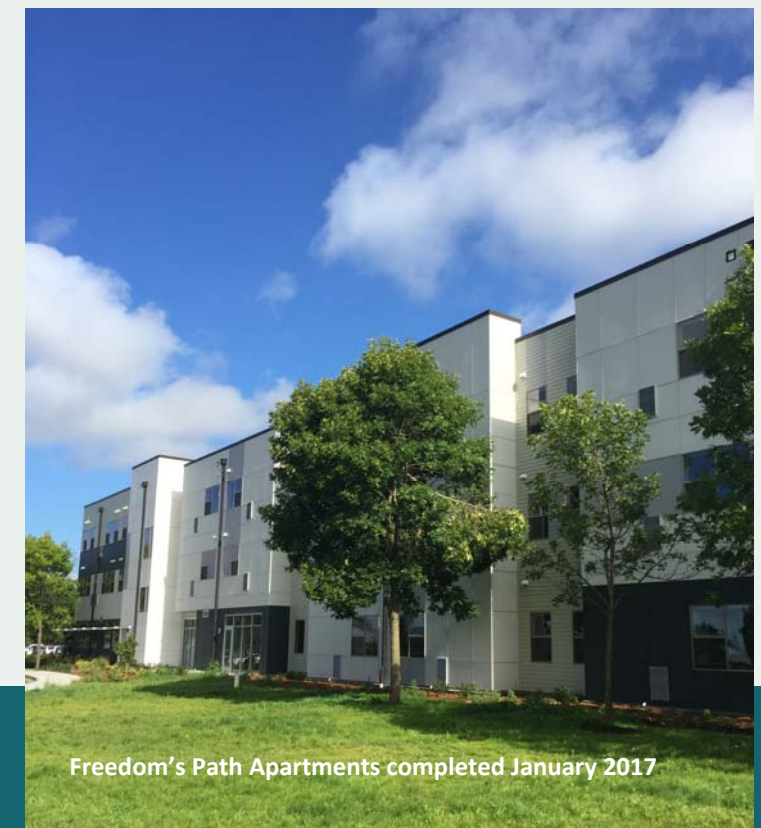
Freedom's Path Apartments completed January 2017