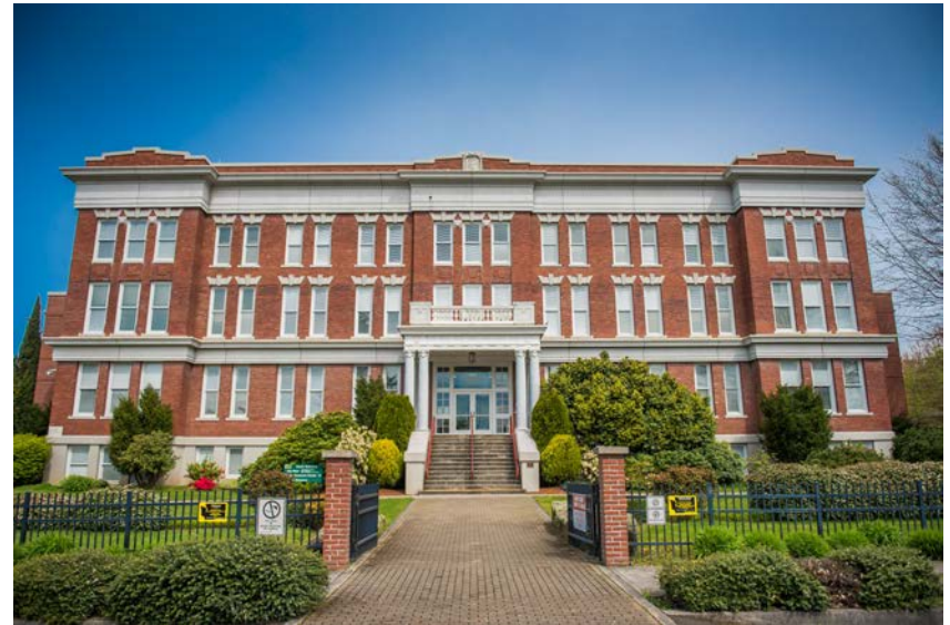
Washington State School for the Blind