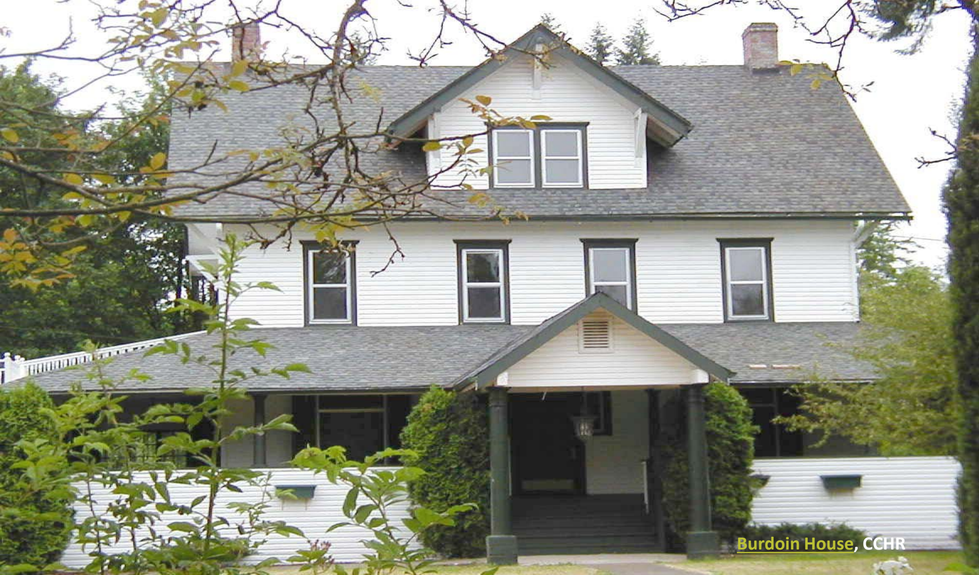
Burdoin House , CCHR