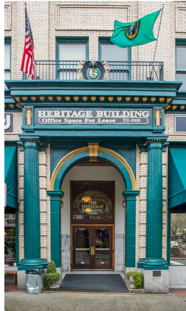
U.S. National Bank Building