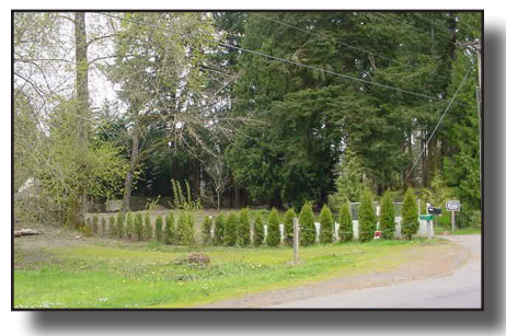
Code Enforcement efforts result in major clean-up of this residential property.

Our purpose is to protect the safety and welfare of our residents, to promote and preserve community livability through an effective compliance program.