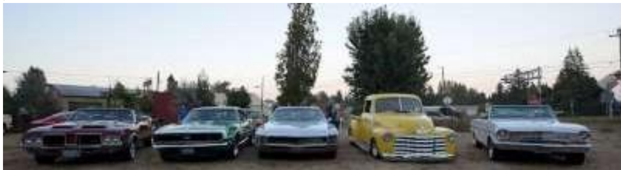
Vintage vehicles showing off their muscle at the 2018 Cruise In.