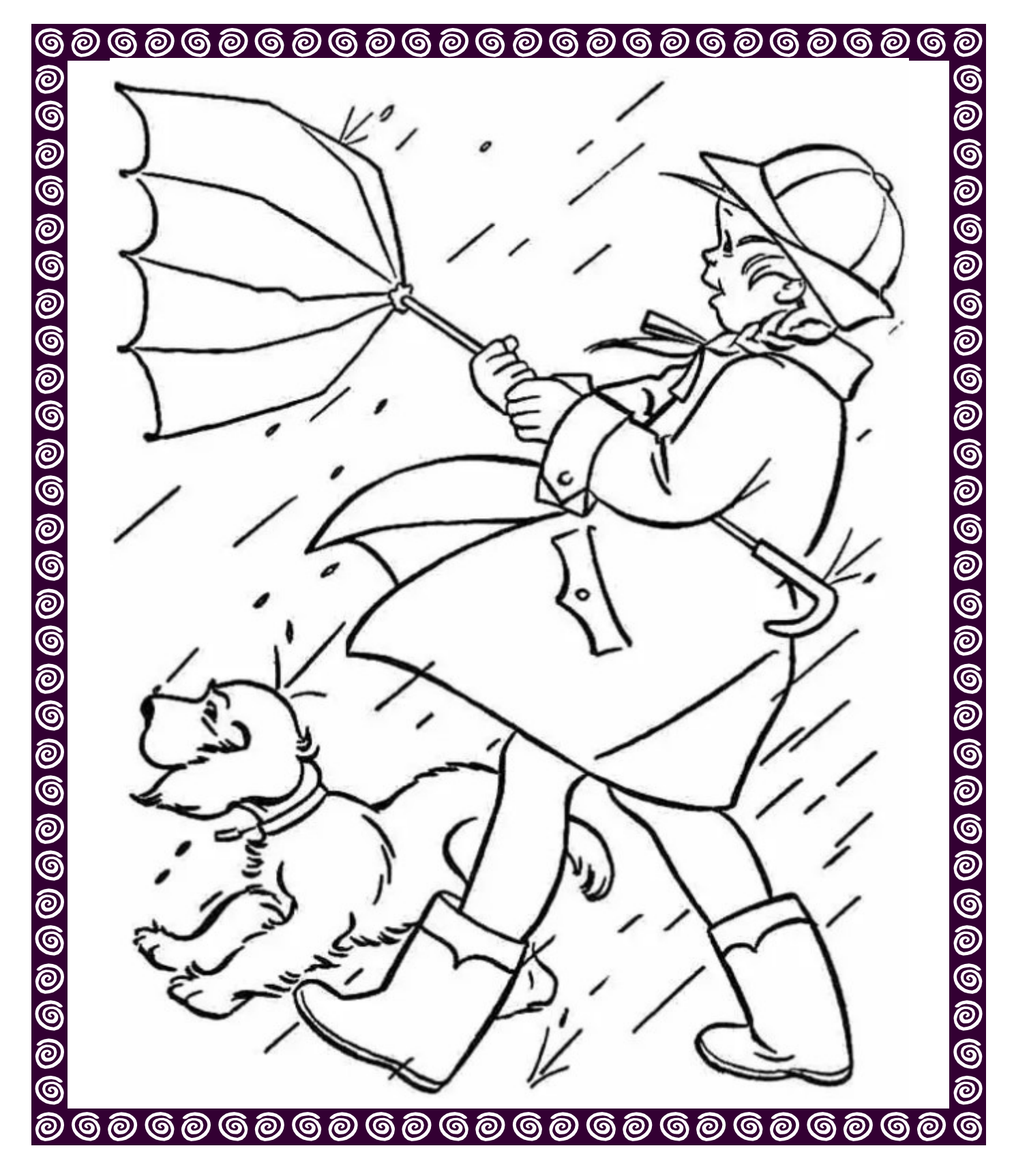
Kids' Coloring Page

(To learn how to download, print or save a .pdf (like this newsletter), or to print selected pages, see: <a href="wikihow.com/Download-PDFs">wikihow.com/Download-PDFs</a> .)