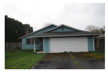
40<sup>th</sup> Ave Home