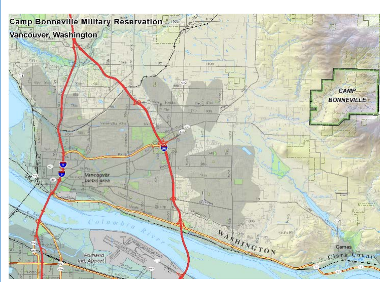
Location of Camp Bonnvillle Cleanup Site, Clark County