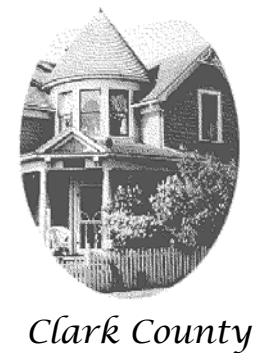
Clark County Historic Preservation Commission