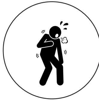
shortness of breath or difficulty breathing