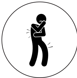
muscle or body aches