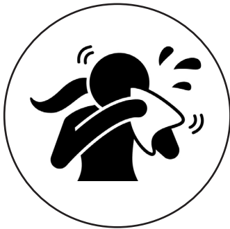
congestion or runny nose