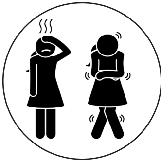
fever or chills

Symptoms may appear 2-14 days after exposure to the virus. People with these symptoms may have COVID-19. This list does not include all possible symptoms.