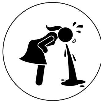
nausea or vomiting