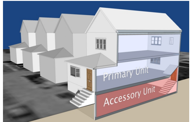
Figure 1 - Single structure housing primary dwelling and ADU

Yes. The exterior appearance of an addition or detached ADU shall be architecturally compatible with the primary residence, including architectural style/design, window style/placement, building materials and colors, roof form/pitch, and landscaping. Plain concrete, concrete block, corrugated metal, or plywood are prohibited if they are not the predominant exterior finish material on the primary dwelling. In addition, for buildings over 15 feet in height, the pitch of the ADU roof must be the same as the predominant pitch of the primary dwelling structure.