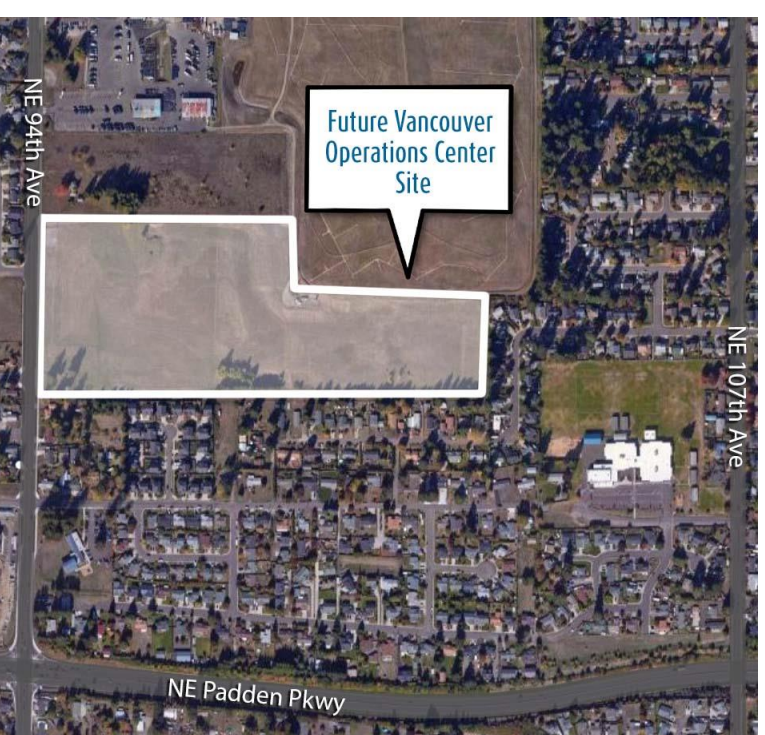
Public Works New Operations Campus - 8