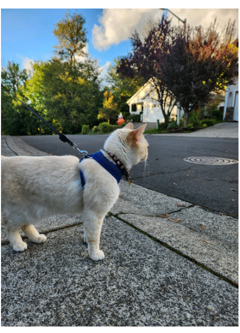
Mr. Roarke loves short walks, Doritos and Cheetos!

Natural Instincts: Cats are instinctively territorial animals. They form strong attachments to their home environment and are naturally inclined to defend it against perceived threats. This territorial nature translates into a protective instinct, prompting cats to be vigilant to potential dangers that may encroach upon their territory.