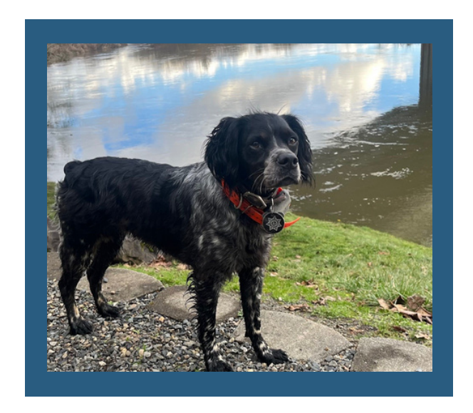
"Hello, I am LaKota. I am a 19-month-old French Brittany. I am a bit stubborn, and Cinnamon lets me know who the Boss is. We love our job on Dog Patrol."

Would you like your Paws on Patrol pet(s) to be featured in a future newsletter? Send info and photos to: