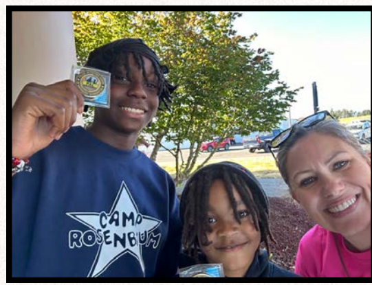
IN JULY, SEVERAL DEPUTIES ATTENDED CAMP ROSENBAUM, A SUMMER CAMP FOR YOUTH.