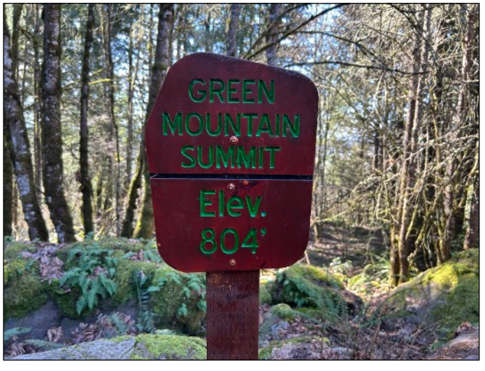
It is about 1.4 miles with 540 feet of elevation gain to hike from the west trailhead for Green Mountain to the summit.

From this junction, there is a dead-end spur to the right for 0.21-mile to a viewpoint overlooking the surrounding area.