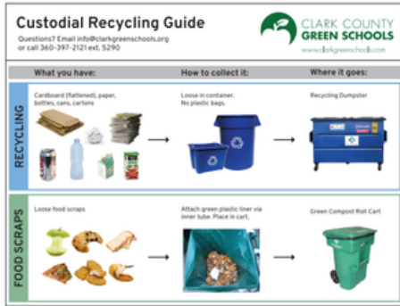
CUSTODIAL RECYCLE GUIDE for custodial reference 11" wide 8.5" long