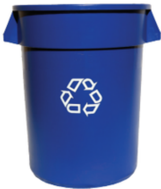
32 GALLON BRUTE CAN for central collection areas 22" diameter 27.25" tall