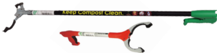
"NIFTY NABBERS" for removal of contaminants from food waste cart in cafeteria, 18" or 36" long