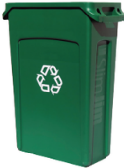
"SLIM JIM" for kitchen 22.5" wide 30" tall 11" deep

Accessories include: signs, white 5-gal bucket & filter, blue ring, black ring, 32-gal blue Brute, 2 "Nifty Nabbers." Note: garbage can is not provided