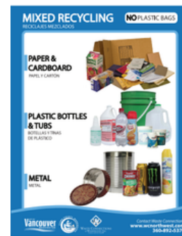
KITCHEN RECYCLE GUIDE for kitchen reference 8.5" wide 11" long