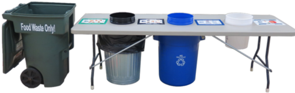
SORT TABLE for elementary & middle school cafeterias 30" wide 96" long 30.5" tall

Accessories include: signs, white 5-gal bucket & filter, blue ring, black ring, 32-gal blue Brute, 2 "Nifty Nabbers." Note: garbage can is not provided