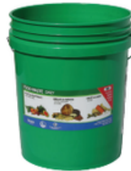
5-GALLON BUCKET for kitchen prep 12" diameter 15" tall