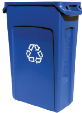
"SLIM JIM" for copy rooms, library 22.5" wide 30" tall 11" deep