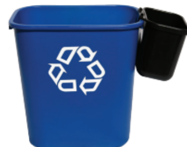
DESKSIDE RECYCLING CAN & GARBAGE SIDECAR for offices 10.5" wide 15.25" tall 15" deep