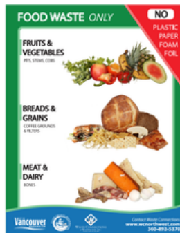
KITCHEN FOOD WASTE GUIDE for kitchen reference 8.5" wide 11" long