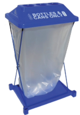
"CLEARSTREAM" for hallways, cafeteria in middle and high schools 26.5" wide 42" tall 20.5" deep