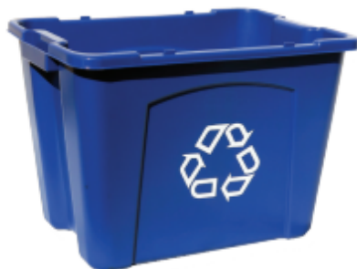
CLASSROOM RECYCLE BIN for classrooms or high- volume offices 21" wide 15" tall 16" deep